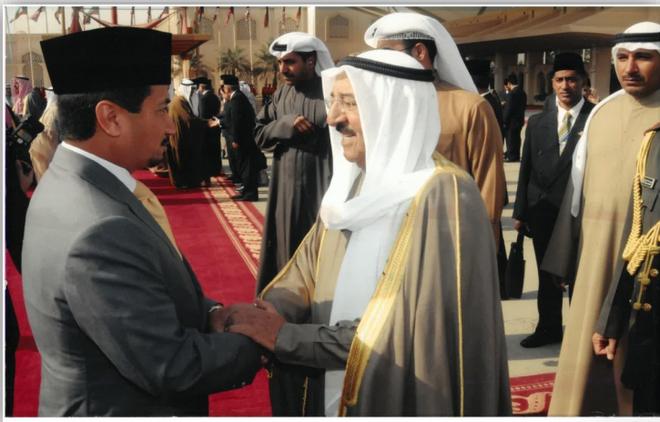
HH the Amir bids farewell to His Majesty Seri Paduka Baginda Yang di-Pertuan at the Amiri Terminal, Kuwait International Airport in 2008