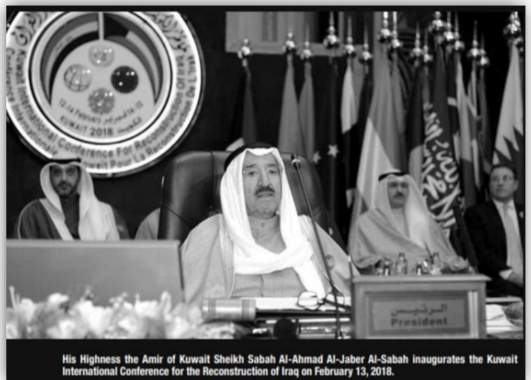
His Highness the Amir of Kuwait Sheikh Sabah Al-Ahmad Al-Jaber Al-Sabah inaugurates the Kuwait International Conference for the Reconstruction of Iraq on February 13, 2018.