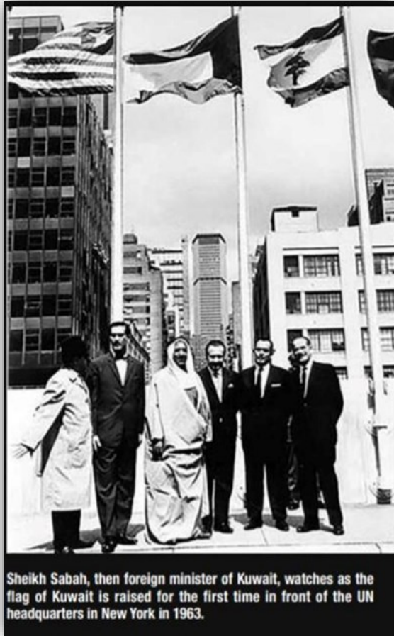
Sheikh Sabah, then foreign minister of Kuwait, watches as the flag of Kuwait is raised for the first time in front of the UN headquarters in New York in 1963.