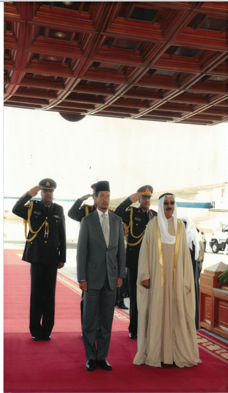
Welcoming Ceremony for His Majesty Seri Paduka Baginda Yang di-Pertuan Agong at the Amiri Terminal, Kuwait International Airport in 2008