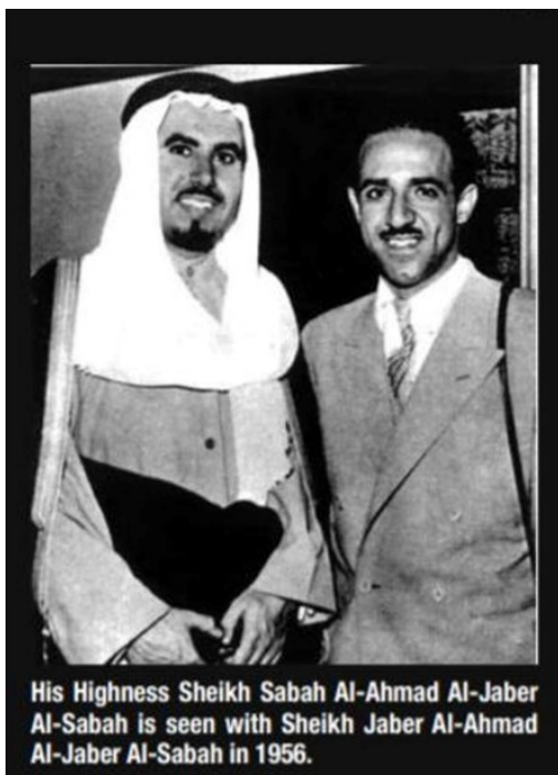
His Highness Sheikh Sabah Al-Ahmad Al-Jaber Al-Sabah is seen with Sheikh Jaber Al-Ahmad Al-Jaber Al-Sabah in 1956.