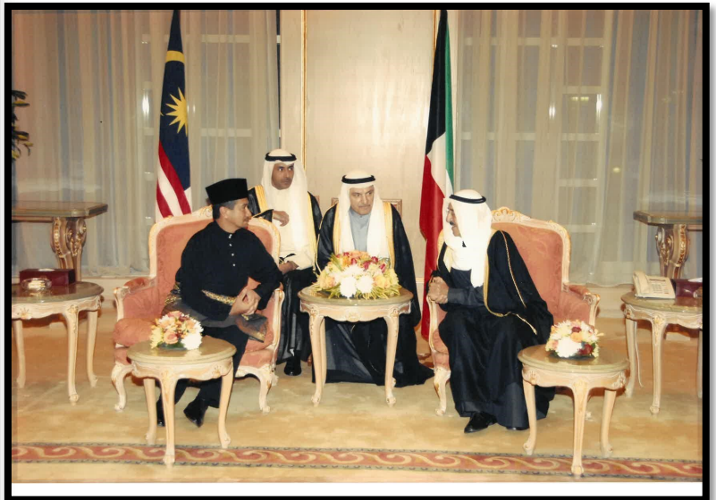
His Majesty Seri Paduka Baginda Yang di-Pertuan Agong calls upon HH the Amir during the State Dinner in 2008