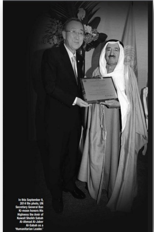
In this September 9, 2014 file photo, UN Secretary General Ban Ki-moon honors His Highness the Amir of Kuwait Sheikh Sabah Al-Ahmad Al-Jaber Al-Sabah as a 'Humanitarian Leader.'