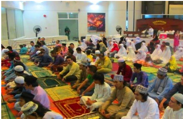
MYUAE members attended special prayers function at Surau on 20 February 2015