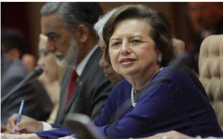
2 nd Islamic Economy Award