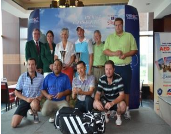
Tourism Malaysia arranged Winter Golf Championship Sharjah @ 22.03.2015