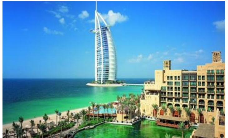
Burj Al-Arab, Dubai