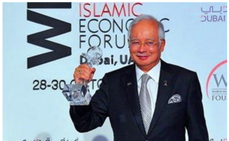
10 th WIEF, Dubai