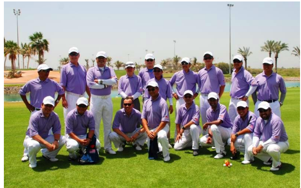
Dubai Ryder Cup competition between Malaysia and Singapore diaspora residing in Dubai, January 2015