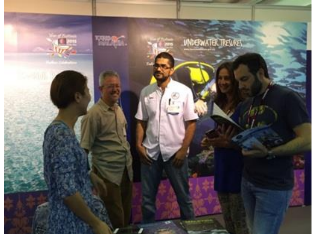
Tourism Malaysia promoting Malaysia Islands , sail and cruise in Dubai International Boat Show (3-7 March)