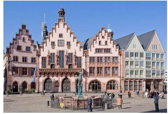
Römer, Frankfurt am Main