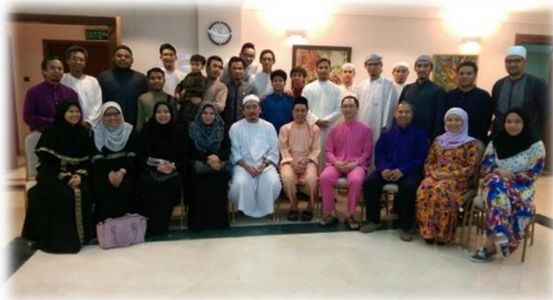
Iftar and Terawikh, Embassy of Malaysia, 19 & 26 June 2015 and 3 July 2015