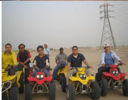
Boys' Day Out. ATV (buggy) ride in the desert. Winter 2006/07.

Life in Kuwait is quite interesting and enjoyable. As a Muslim family, we are appreciative of the Islamic environment here. We still miss Malaysia though, especially in the middle of scorching summer heat. There are only two distinct seasons here; winter which lasts from mid-November to February and summer which runs from June to mid-October. Spring and autumn are experienced as short intervals between the two seasons.