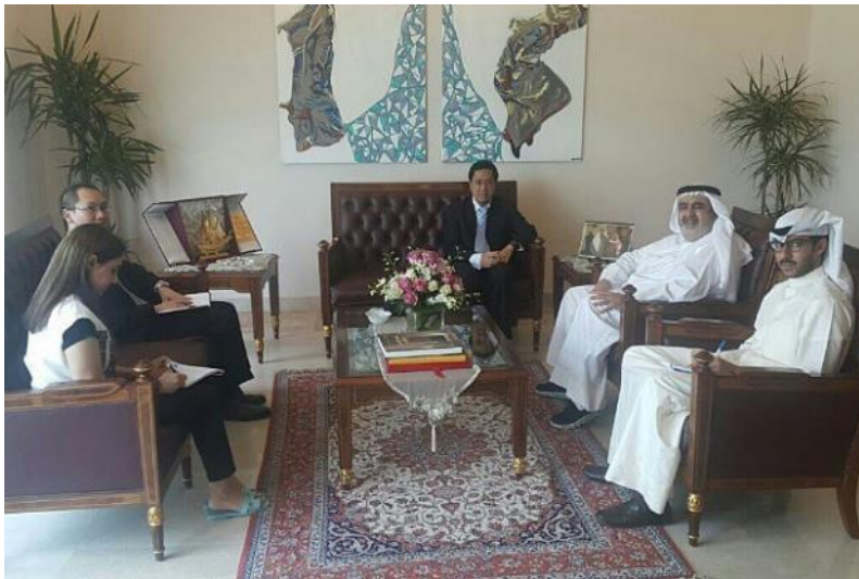
Meeting with Ambassador Adul Hamad Al-Ayyar, Assistant Foreign Minister for Economic Affairs, 1 July 2015