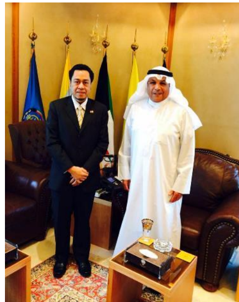
Courtesy Call on His Excellency Lieutenant General Sheikh Khaled Al-Jarrah Al-Sabah, Deputy Prime Minister and Minister of Defence, 9 August 2015