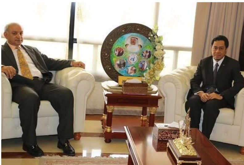
Courtesy Call on His Excellency Bader Hamad Al-Essa, Minister of Education and Minister of Higher Education, 14 July 2015