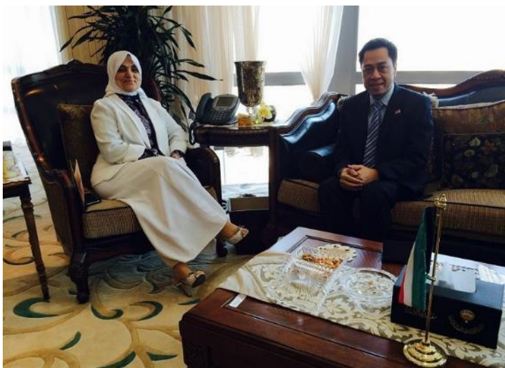
Courtesy Call on Her Excellency Hind Subaih Barak Al-Subaih, Minister of Social Affairs & Labour and Minister of State for Planning & Development, 5 August 2015