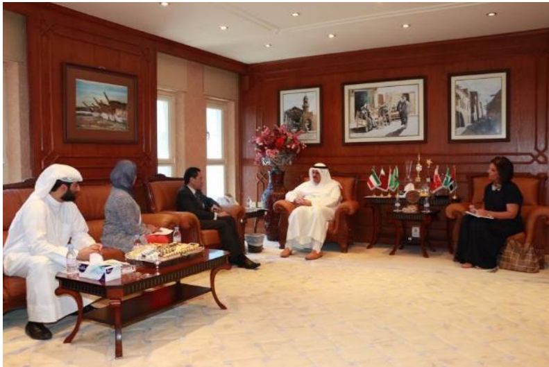
Courtesy Call on His Excellency Sheikh Salman Sabah Salem Al-Homoud Al- Sabah, Minister of Information and Minister of State for Youth Affairs, 4 August 2015