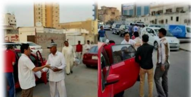
Ramadan “Street Iftar” by the Malaysian Community