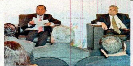
YAB Chief Minister of Perak with Hon. Prime Minister of Sri Lanka

The Sri Lanka Human Capital Summit is aimed to develop a national agenda for developing future human capital to support Sri Lanka's economic growth plans.