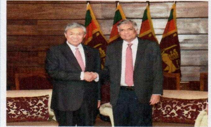
With Prime Minister Ranil Wickremesinghe.

Ministry and the Office of the Deputy Prime Minister.