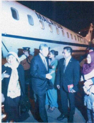
Arrival of the Deputy Premier at the Bandaranaike Airport, Colombo

The Right Honorable Dato' Seri Dr. Ahmad Zahid Hamidi, Deputy Prime Minister of Malaysia made an official visit to Sri Lanka on 21 and 22 July 2016. This is the first visit of the Deputy Prime Minister since assuming the post of deputy prime minister in 28 July 2015. The visit aims to strengthen bilateral relations between Malaysia and Sri Lanka through various fields.