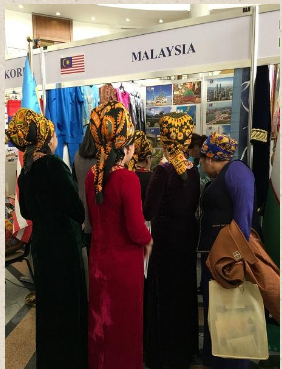
Turkmen ladies flocked to the Malaysian booth.