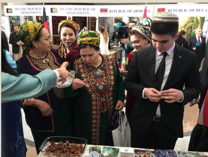
Local visitors tested their luck on the lucky draw.

His Excellency Rashid Meredov, Minister of Foreign Affairs of Turkmenistan, had the honour to visit the Malaysian booth.