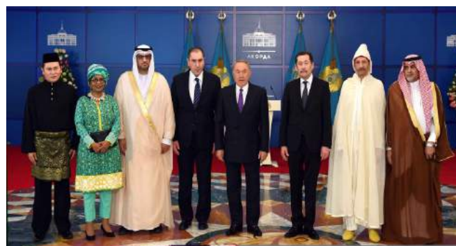
11 April 2017: Presentation of Credentials