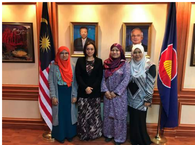
ASTANA, 27 May 2017 : The Iftar and Yassin recital were successfully held on 27 May 2017 on 1 Ramadhan 1438H at Rumah Malaysia. The ceremony was attended by HBS officers and LRS Malaysian Embassy in Kazakhstan with their families. The purpose of the event is to strengthen the friendship among officers and staff. Also present were some Malaysians living in Astana.