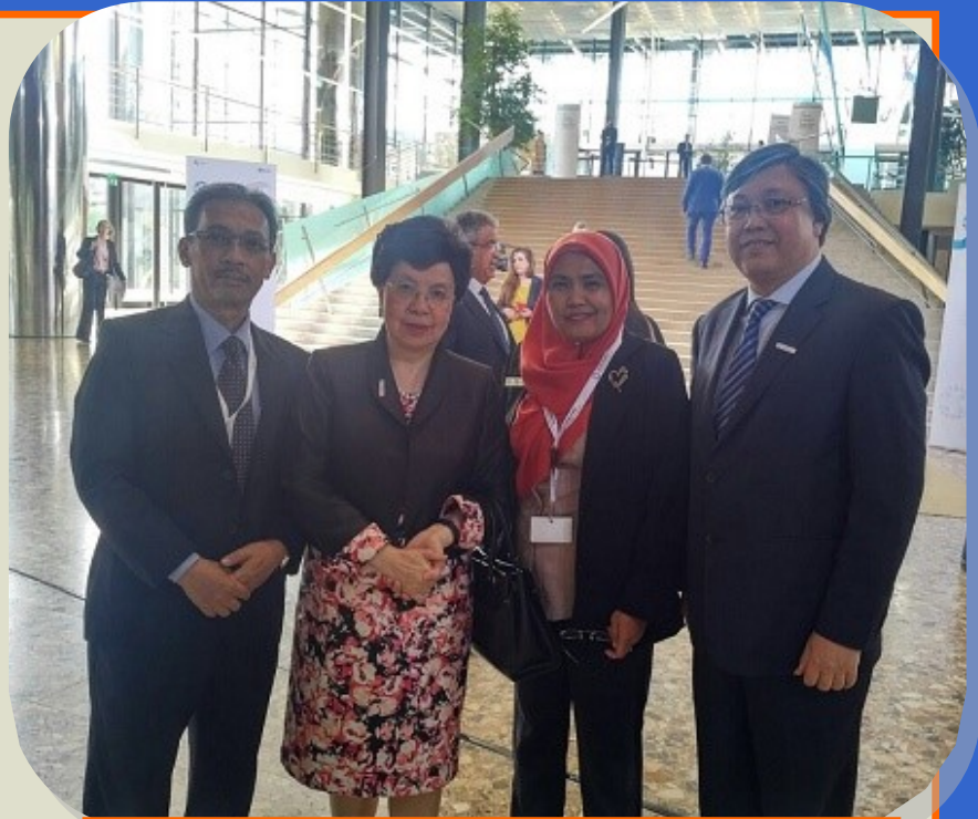
Malaysian delegation with Dr Margaret Chan former Director-General of WHO (2nd from left)

H.E. Ambassador led the Malaysian delegation at the 2nd Global Summit for Patient Safety at the World Conference Centre, Bonn on 29-30 March 2017. The Summit, hosted by the Federal Minister for Health Hermann Groehe, and supported by the World Health Organization (WHO), brought together ministers of health and senior officials from more than 50 countries and international organization.