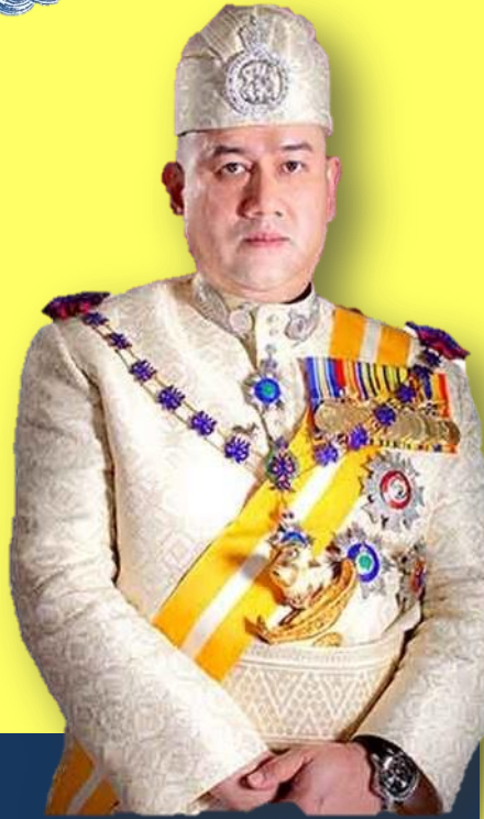
SULTAN MUHAMMAD V