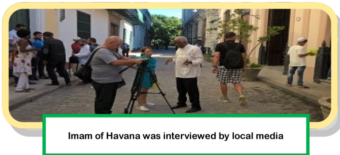
Imam of Havana was interviewed by local media

The Embassy of Malaysia in Havana, Cuba would like to take the opportunity to wish everyone Eid Mubarak. May it be a joyous and blessed celebration with all Muslims wherever you are.