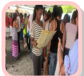
Brochures about Malaysia were distributed