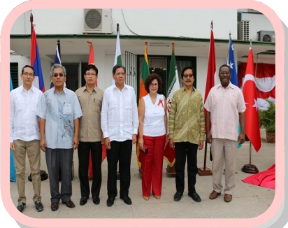
Ambassadors present at the Charity Bazaar