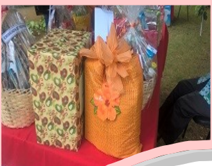
Malaysian lucky draw prizes