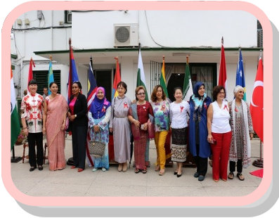
ASIAN Ladies Committee Members