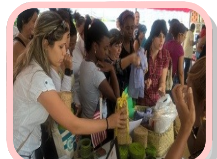
The Malaysian stall