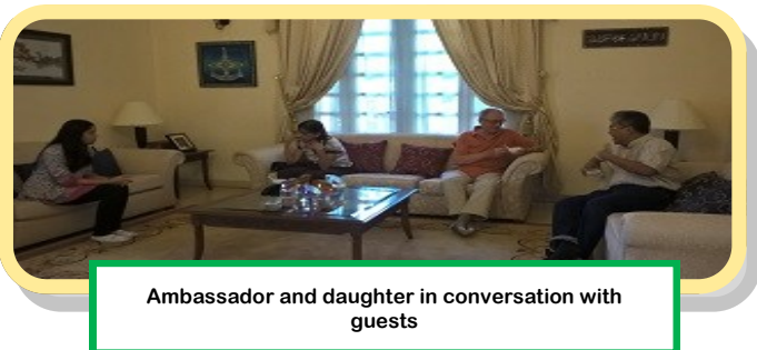
Ambassador and daughter in conversation with guests