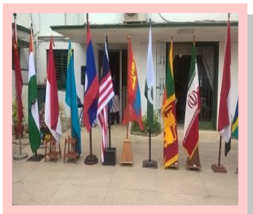
Countries participating at the bazaar