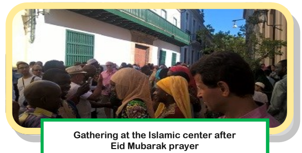
Gathering at the Islamic center after Eid Mubarak prayer