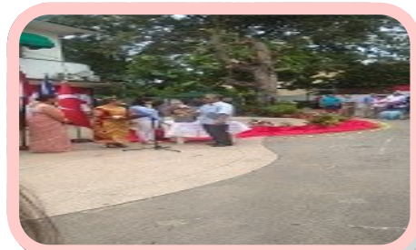
Amb Khairi Omar at the lucky draw session