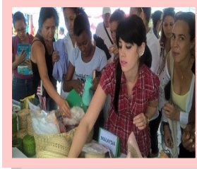
More visitors at the Malaysian stall