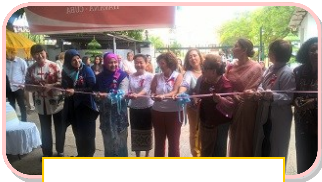
Official ribbon-cutting ceremony by Asian Ladies Committee

Flyers were distributed to create awareness about Malaysia and promote Malaysia as a top tourists' destination in Asia.