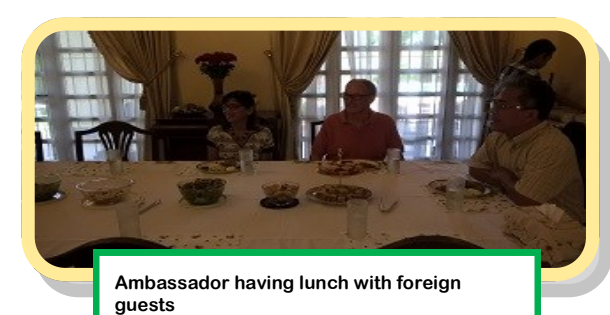
Ambassador having lunch with foreign guests