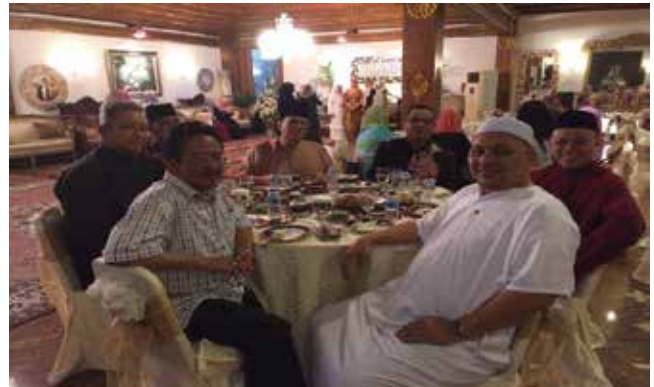
Iftar at Residence with all HBS and MCJ 15 June 2017