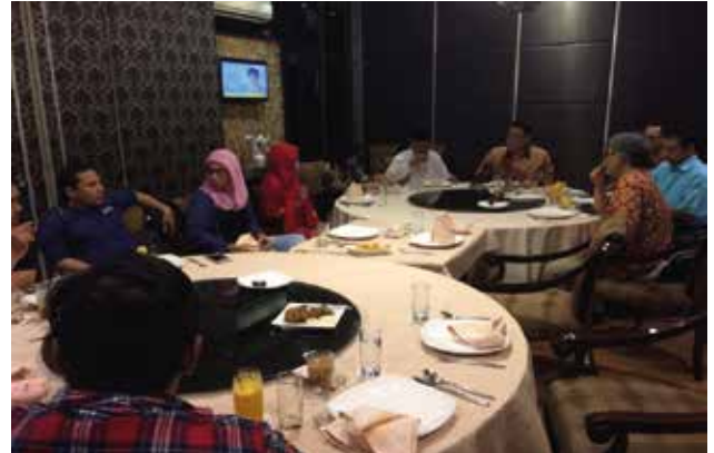
Amb's Iftar with the media corps, 16 June 2017