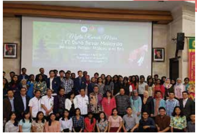
Working Visit of Amb. to Bali, 12 – 13 April 2017