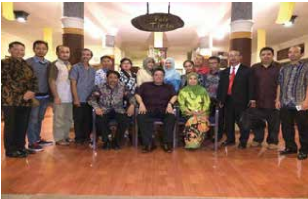
Working Visit of Amb. to Surabaya & Malang, 19 – 23 May 2017