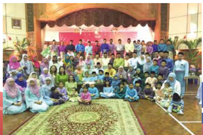
Eidul Fitri Celebration with the Malaysian Community and Staff 25 June 2017