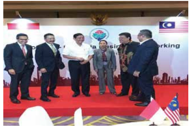
Indonesia – Malaysia Business Networking Dinner, 23 May 2017