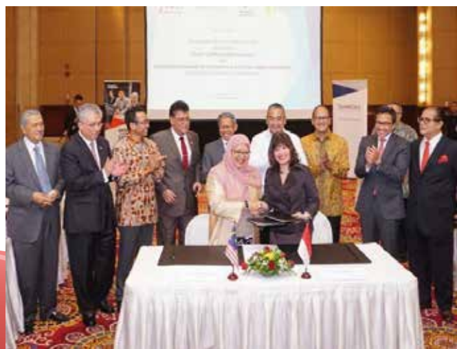
Signing of MOU with KADIN for MYASEAN Internship during Working Visit of YB Dato' Seri Mustapa Mohamed, Minister of International Trade and Industry, 12 June 2017