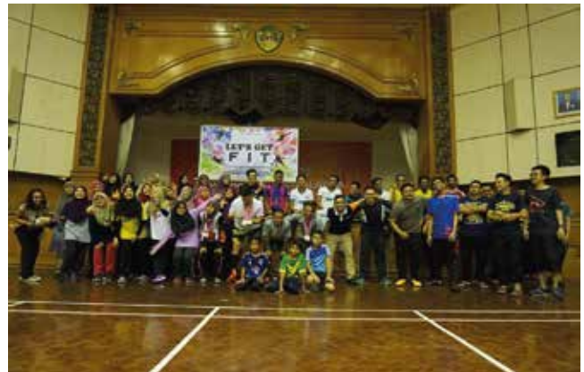
Let's Get Fit Programme 16 April 2017