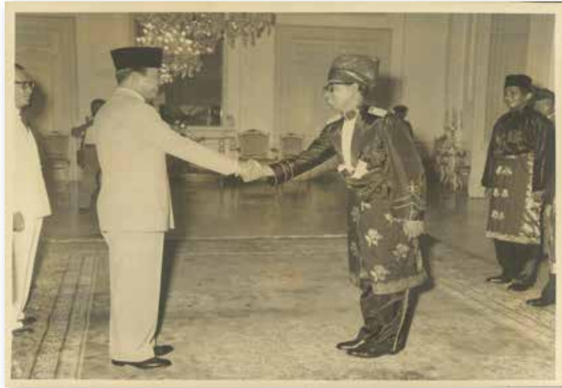
Ceremony of Presentation of the Credential Letters by the Malaysian Ambassador to the President Sukarno, the first President of the Republic of Indonesia

Special tribute to the pioneers in the early days