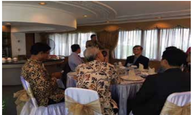
Ambassador Session with the Malaysian Business Community, 24 February 2017