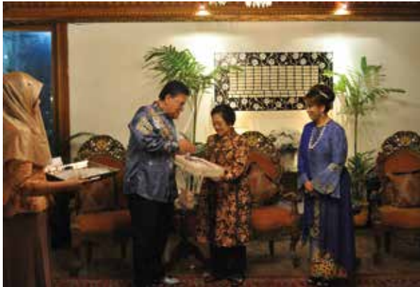
Special Session with Ibu Megawati Sokaernoputri, the Fifth President RI, 12 March 2017