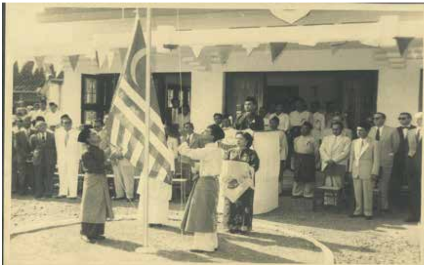
The first National Day Celebration held in 1957 in the old Chancery building at Jalan Imam Bonjol, Jakarta