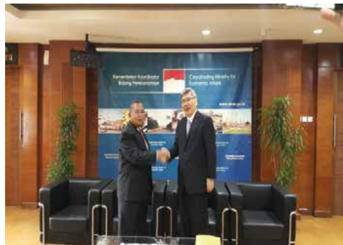
Working Visit of YB Datuk Seri Mah Siew Keong, Minister of Plantation, Industries and Commodities to Jakarta 11 April 2017