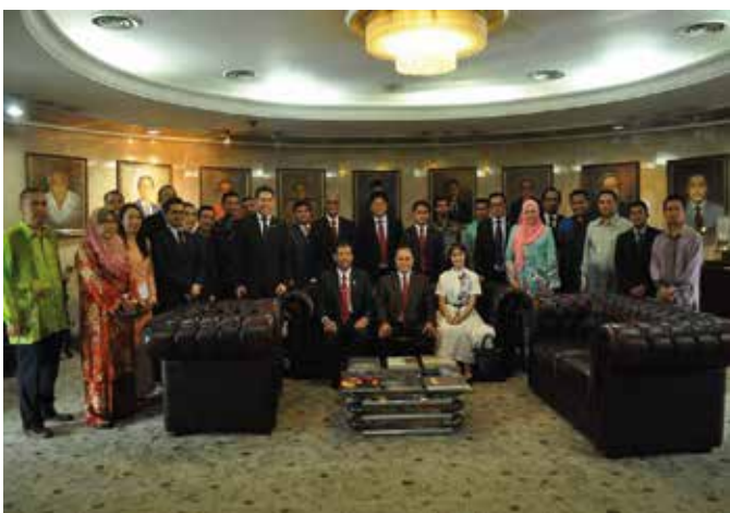
Working Visit of YB Datuk Seri Joseph Entulu Belaun, Minister in the Prime Minister's Department, 5 May 2017