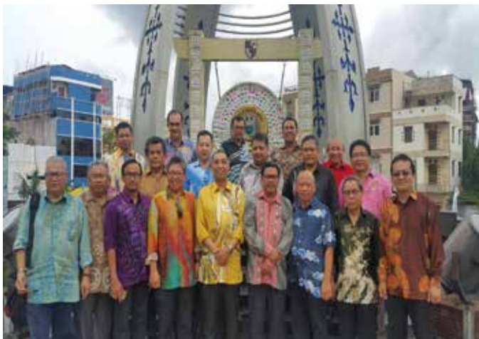
Working Visit of YB Datuk Seri Salleh Said Keruak, Minister of Communication and Multimedia to Ambon for Hari Pers Indonesia, 9 February 2017