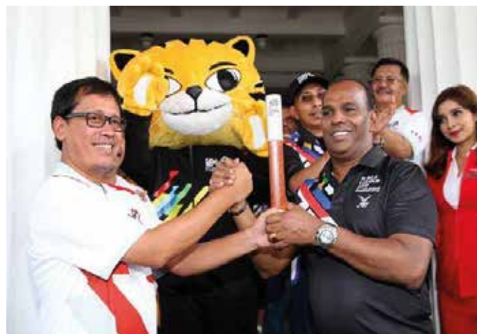
Working Visit of YB Datuk M. Saravanan, Deputy Minister of Youth and Sports for Rising Together Baton Run in Jakarta, 30 April 2017