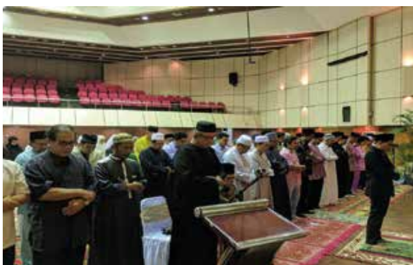
Iftar with YB Minister MITI and Malaysian Community 12 June 2017