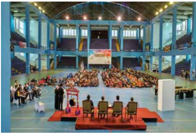
Working Visit of Amb. to Bandung, 28 April 2017