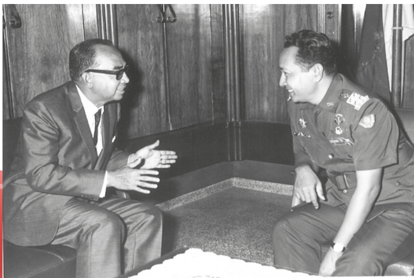
Meeting and interaction between the leaders of Malaysia and the Republic of Indonesia during the early years