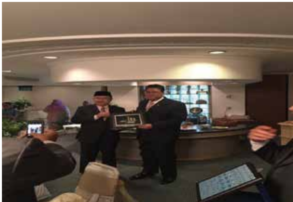
Ambassador Session with JAKIM's Officials 18 April 2017