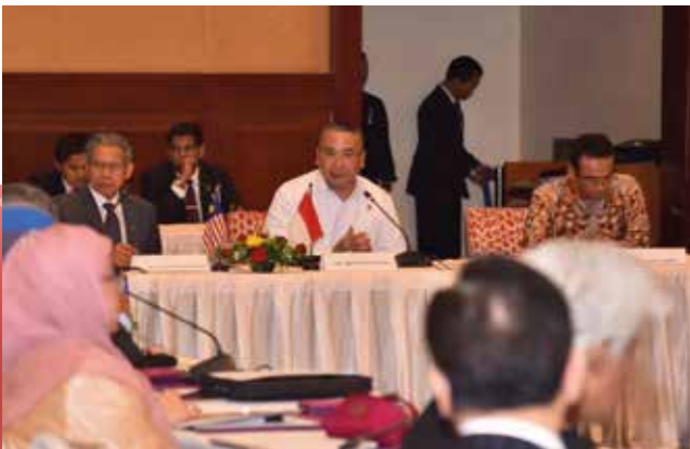
Roundtable Meeting with Malaysian and Indonesian Business Leaders, 12 June 2017