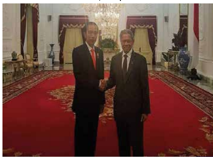
Call on President Joko Widodo, President of the Republic of Indonesia by YB Dato' Seri Mustapa Mohamed, Minister of International Trade and Industry, 12 June 2017