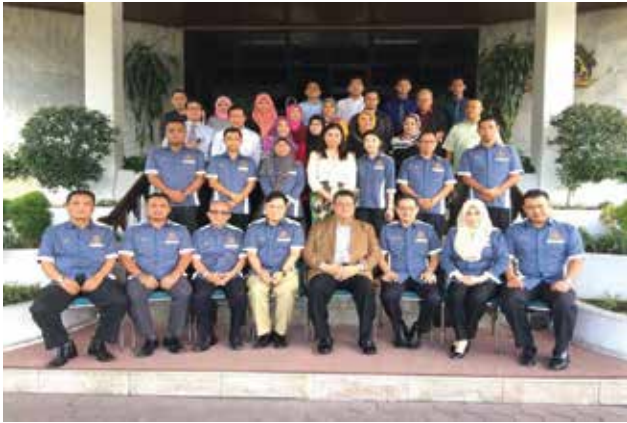
Working Visit of Amb. to Medan, 5 – 6 April 2017