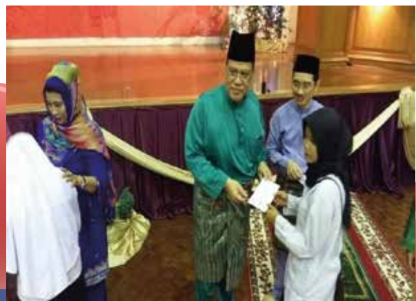
Iftar with the Orphanage and Local Community 18 June 2017