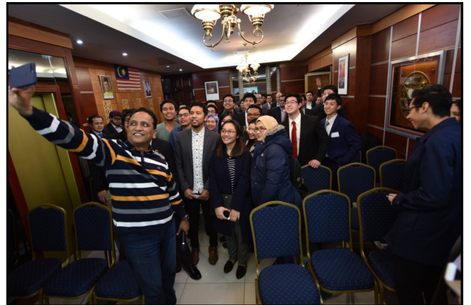
Photo: Selfie moment with fellow Malaysians after the Dialogue session

LONDON, FEB 22: Education Malaysia UK hosted a Dialogue session between Malaysian Deputy Foreign Minister, The Hon. YB Dato' Sri Reezal Merican and Malaysian students and community in London at the EM London office in Bayswater. In a separate event, Dato' Sri Reezal hosted an informal get-together dinner with the staffs, students and friends of the High Commission at the Chancery in Belgrave Square. Dato' Sri Reezal was on a 5-day working visit to the United Kingdom.