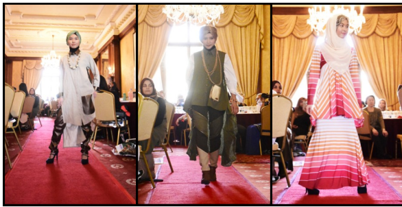
Some of the collections on show