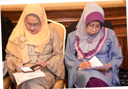
Members filling in their ballots