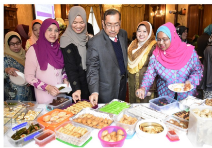
The buffet prepared by members