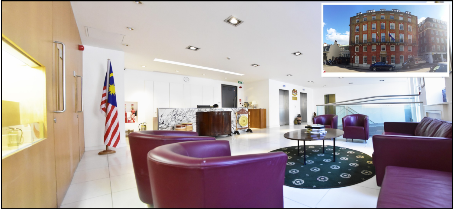
Main photo: The main lobby and reception. (Inset: 52 Bedford Row, London)

AS 45 BELGRAVE SQUARE UNDERGOES REFURBISHMENTS