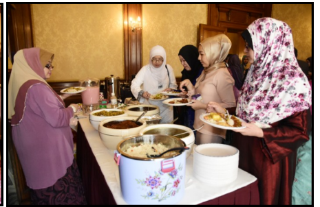
Lunch buffet prepared by members of the Perwakilan