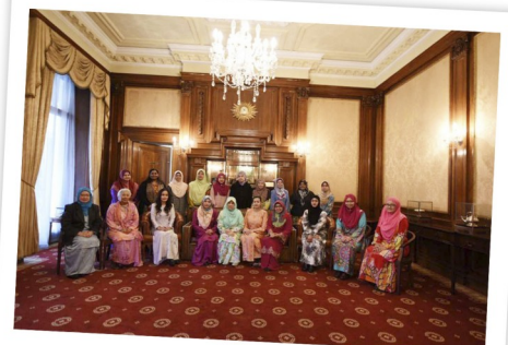
The newly elected committee members