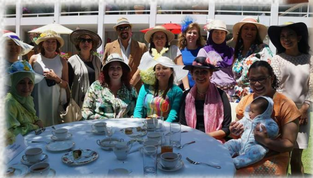
Asociación de Cónyuges de Diplomáticos (ACD)'s Garden Tea Party