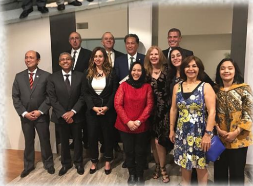
← Dinner with the Media Representative & Hotelier