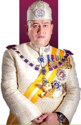
SULTAN MUHAMMAD V