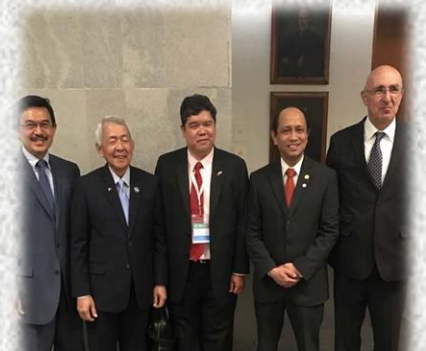
(L-R) Ambassador of Indonesia; Secretary of Foreign Affairs of the Philippines; Ambassador of the Philippines; Ambassador of Malaysia and Ambassador of Algeria

In his statement at the Conference, H.E. Yasay speaking as Chair of ASEAN iterated the importance of the Treaty of Tlatelolco as well as the Southeast Asia Nuclear-Weapon Free Zone (SEANWFZ) in the context of preserving the global peace and security free from nuclear weapons and all other weapons of mass destruction.