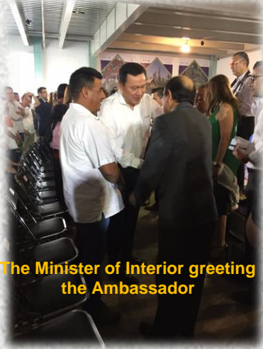
The Minister of Interior greeting the Ambassador