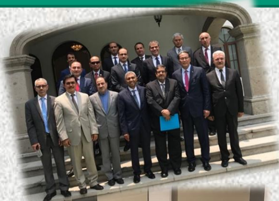
← 27th MEETING COUNCIL OF THE AMBASSADORS OIC GROUP – MEXICO CITY