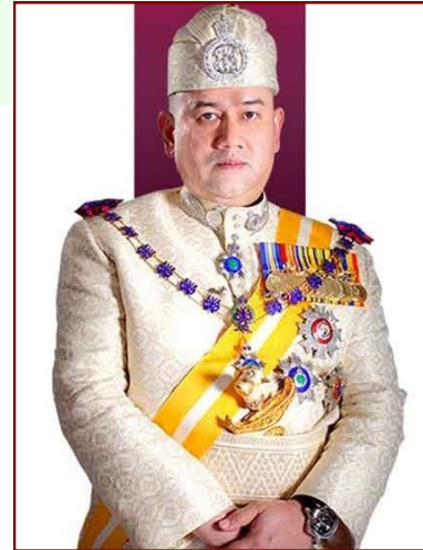
15th Yang di-Pertuan Agong Sultan Muhammad V

The Sultan of Perak, Sultan Nazrin Muizzuddin Shah, was officially appointed as the Deputy Yang di-Pertuan Agong at the same ceremony. -End-