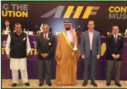
KDYMM Tengku Mahkota Pahang was in the Sultanate of Oman from 29-31 March 2017 to attend the Congress of Asian Hockey Federation (AHF) in his capacity as the President of AHF .