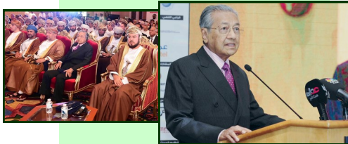
YABhg. Tun Dr. Mahathir Mohamad, former Prime Minister of Malaysia, presented the keynote address at the 3rd Duqm Society and Economy Forum in Muscat on 9 May 2017.