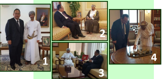
H.E. Shahril Effendi Abd. Ghany, Ambassador of Malaysia to the Sultanate of Oman, made a series of courtesy calls on several dignitaries including the Minister of State and Governor of Muscat (1), Minister Responsible for Defence Affairs (2), Minister of Information (3) and Chairman of State Council (4).