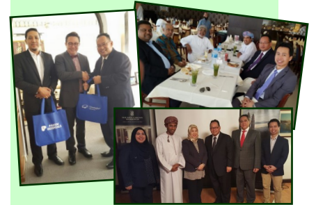
Meeting with various companies and individuals from Malaysia such as Pantai Hospital (left), National Chamber of Commerce of Malaysia (top right) and Reconsult PLT (below right).