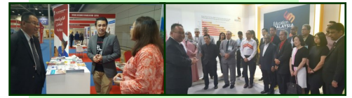
Visiting Malaysia Healthcare Travel Council (left) and Education Malaysia Global Services (right) booths at the Oman Convention and Exhibition Centre.