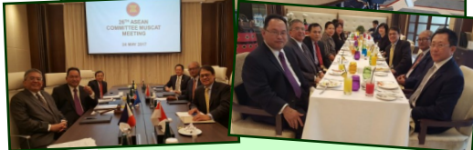
Malaysia completed its Chairmanship of the ASEAN Committee in Muscat for the period January-June 2017.