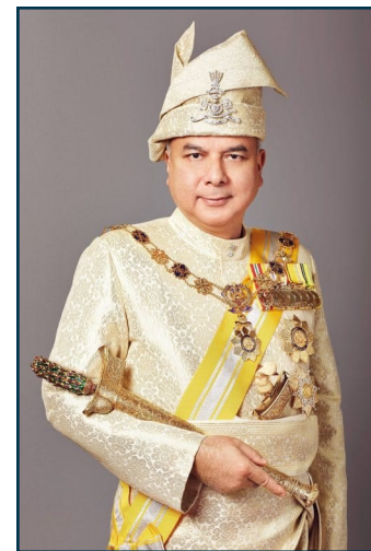
Deputy Yang di-Pertuan Agong Sultan Nazrin Muizzuddin Shah