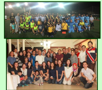
The ASEAN Committee in Muscat organised a Futsal Tournament (top) and an ASEAN Barbecue Night (below) to promote camaraderie among the members of the ASEAN community.