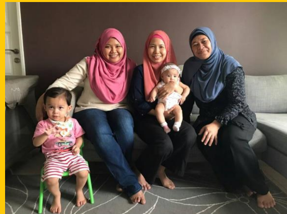
PERWAKILAN'S family outing