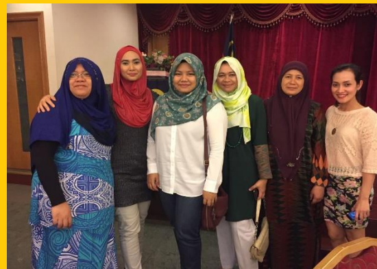
Malaysian ladies in PNG