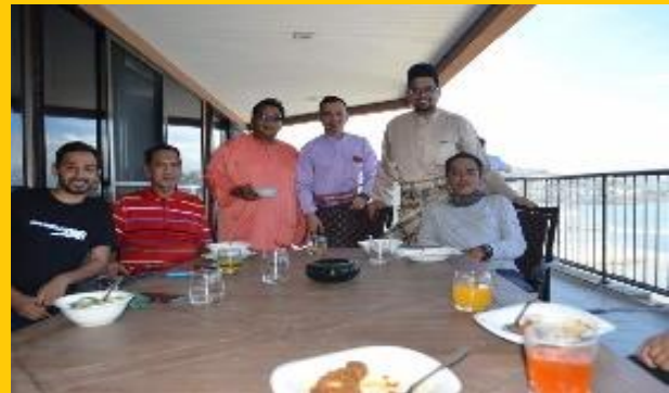
Get together during the open house at the High Commissioner's residence