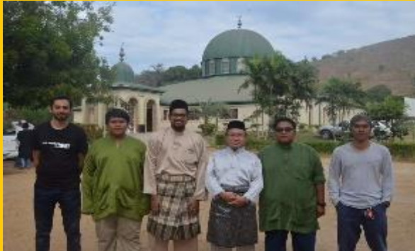
Photo session with Malaysian at the Mosque in Port Moresby after the Eid-ul-Fitr prayers.