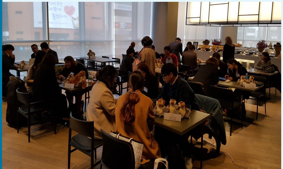
STB Road show in Ulsan - Travel mart session