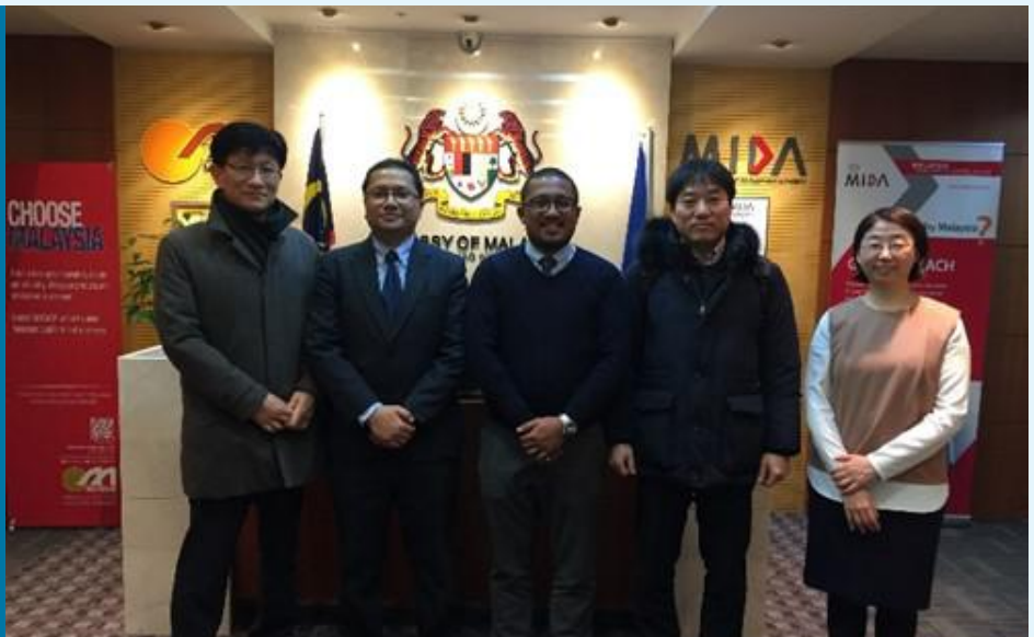
Visit by Huchem Fine Chemical Corporation to MIDA on 26 January 2017. Huchem Fine Chemical Corporation is the manufacturer of fine chemical products such as DiNitroToluene (DNT), MonoNitroBenzene (MNB), Nitric Acid and Ammonium Nitrate