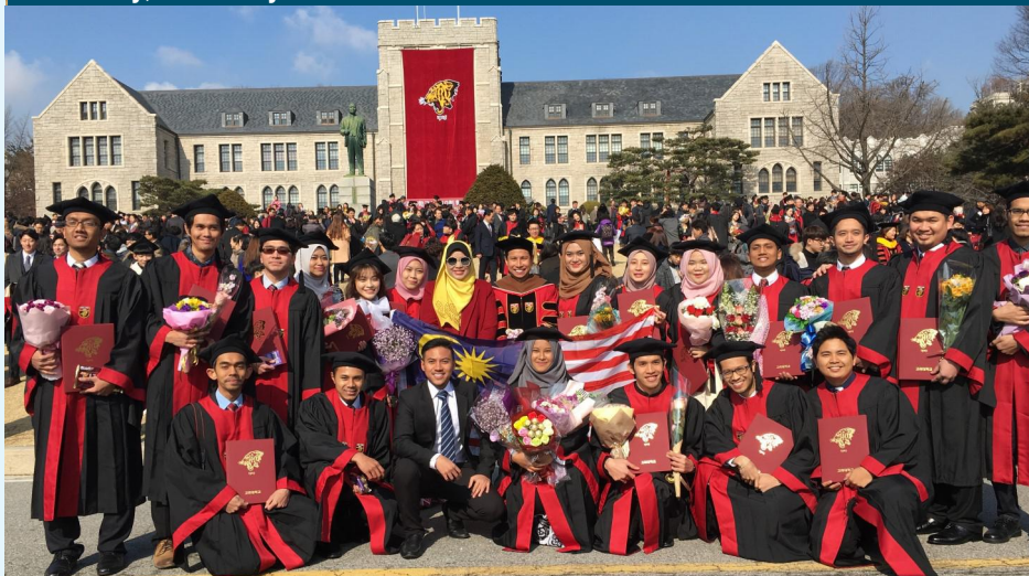
The Education Office attended the graduation ceremony of 23 JPA scholars at Korea University on 25 February 2017