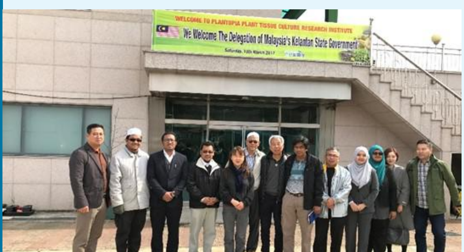
Visit to Plantopia Plant Tissue Culture Research Centre together with Kelantan State EXCO and officials on 11 March 2017