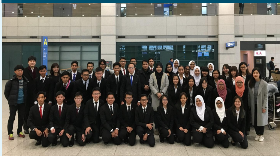
Welcoming the new 41 intakes of Malaysian students to the Republic of Korea on 19 February 2017. The new students will begin their language education at Language Education Institute (LEI), Seoul National University (SNU).