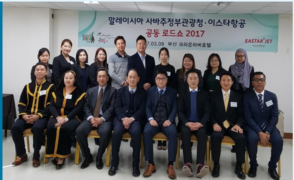
2017 MICE Roadshow at Lotte Hotel from 6-8 March 2017