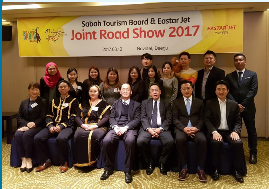
Sabah & Eastar Jet Joint Road Show 2017, 9-13 March 2017