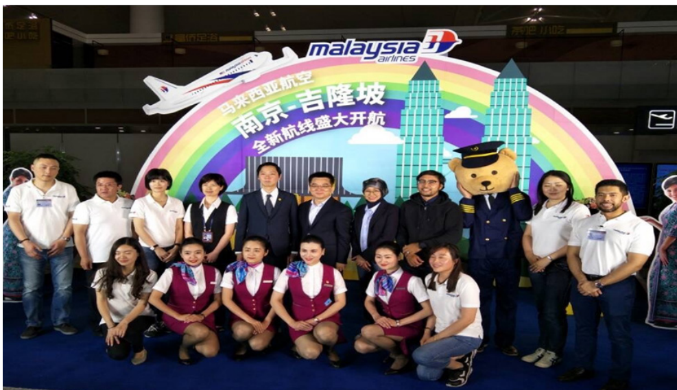
Interview by Jiangsu Broadcasting system (Jiangsu TV) during the launching of Malaysian Airlines Nanjing – Kuala Lumpur flight, 13 June 2017