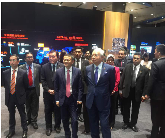
Tour of the Alibaba Pavilion

At the invitation of Mr. Jack Ma, founder and Executive Chairman of Alibaba Group, the Honorable Prime Minister also visited the Headquarters of Alibaba Group in Hangzhou. During the ensuing discussions, both the Prime Minister and the Executive Chairman of Alibaba Group agreed on the way forward to further strengthening the close cooperation in the digital economy sector.