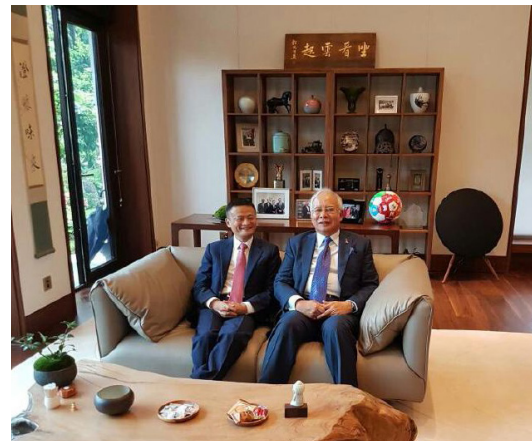
Exchange of views at the office of Mr. Jack Ma, Executive Chairman of Alibaba Group