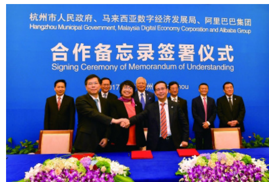
Signing of a Memorandum of Understanding between MDEC, Hangzhou Municipal Government and Alibaba (China)