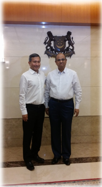
Farewell Lunch hosted by Minister for Foreign Affairs— H.E. Vivian Balakrishnan on 11 April 2017