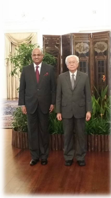
Farewell Call on President Tony Tan on 18 April 2017