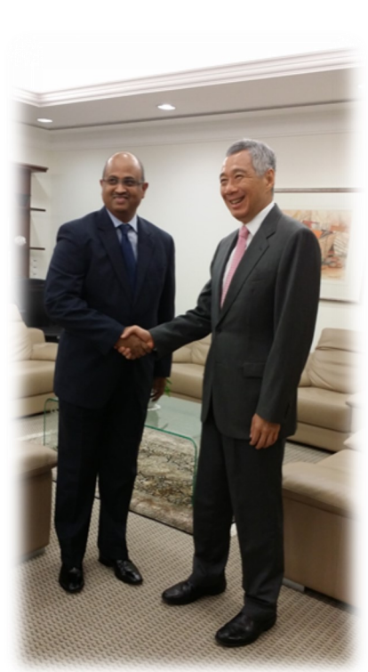
Farewell Call on Prime Minister Lee Hsien Loong on 24 April 2017