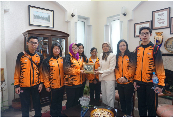
10 April 2017 - The Malaysian National Youth Chess Team was in Tashkent to participate in the Asian Youth Chess Championship which was held from 31 March to 10 April 2017.