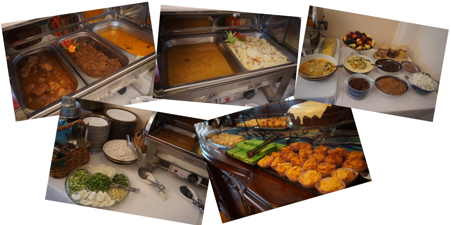
Traditional dishes served i.e. Rendang , Lodeh , Nasi Hujan Panas , Laksa , Kuzi and assortment of Kuih Raya , fully prepared by the Ambassador herself and the Home Based Staff of the Embassy.