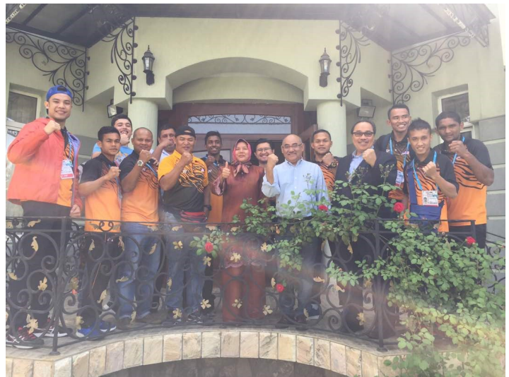
5 May 2017 - The Malaysian National Boxing Team was invited by Her Excellency Ambassador for a brunch at the Residence. The Team was in Tashkent from 30 April to 7 May 2017 to participate in the Asian Boxing Championship.