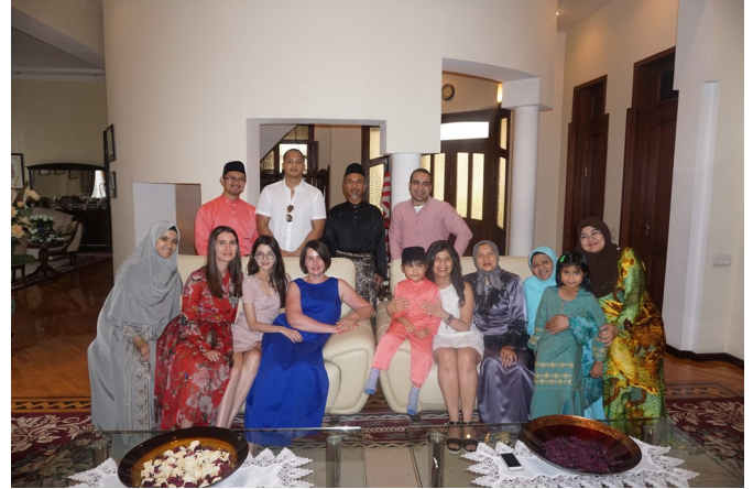
Apart from the Home Based Staff and families, other invited guests were the Royal couple from the State of Pahang, local contacts and diplomatic representatives in Tashkent.