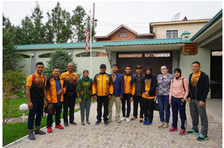
16 April 2017 - The Malaysian National Silat Team visited Uzbekistan from 10 to 17 April 2017 for joint exercises with the local Silat teams in Tashkent, Samarkand and Bukhara.