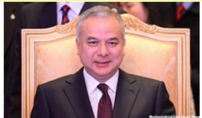
The Sultan of Perak, Sultan Nazrin Muizzuddin Shah, was officially appointed as the Deputy Yang di-Pertuan Agong at the same ceremony.

Sultan Muhammad V becomes the 15 th Yang di-Pertuan Agong of Malaysia, corresponding with 60 years of Malaysia's independence. The last time a Sultan of Kelantan was the Yang di-Pertuan Agong was in 1975, in the form of Sultan Muhammad V's grandfather.