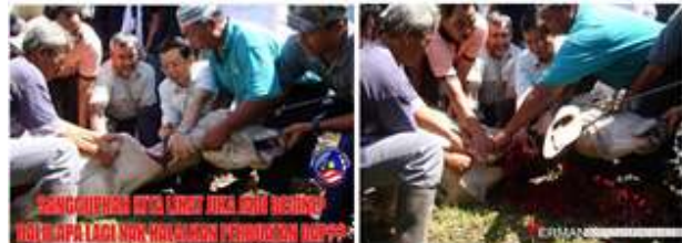
Gambar 'SUPERIMPOSE' direka Umno -Lim Guang Eng Sembelih Lembu Korban?