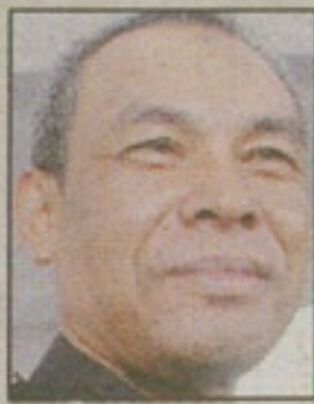
Deputy IGP Datuk Seri Musa Hassan

If we find that any of our personnel had abused their powers, we will take stern action... if you break the law, we will act.'