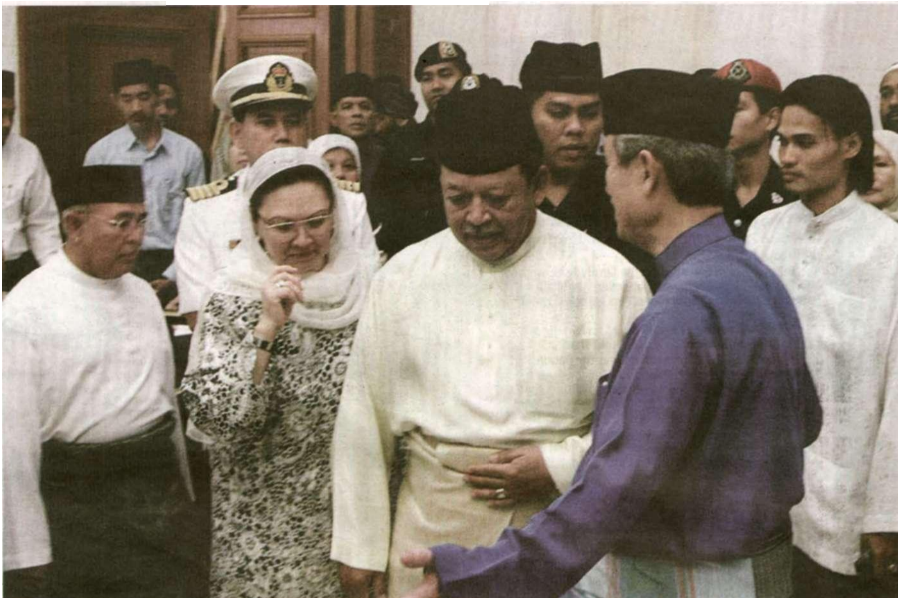
ROYAL GOODBYE: Abdullah speaking with the King and Queen who had come to Sri Perdana to offer their condolences to the family.