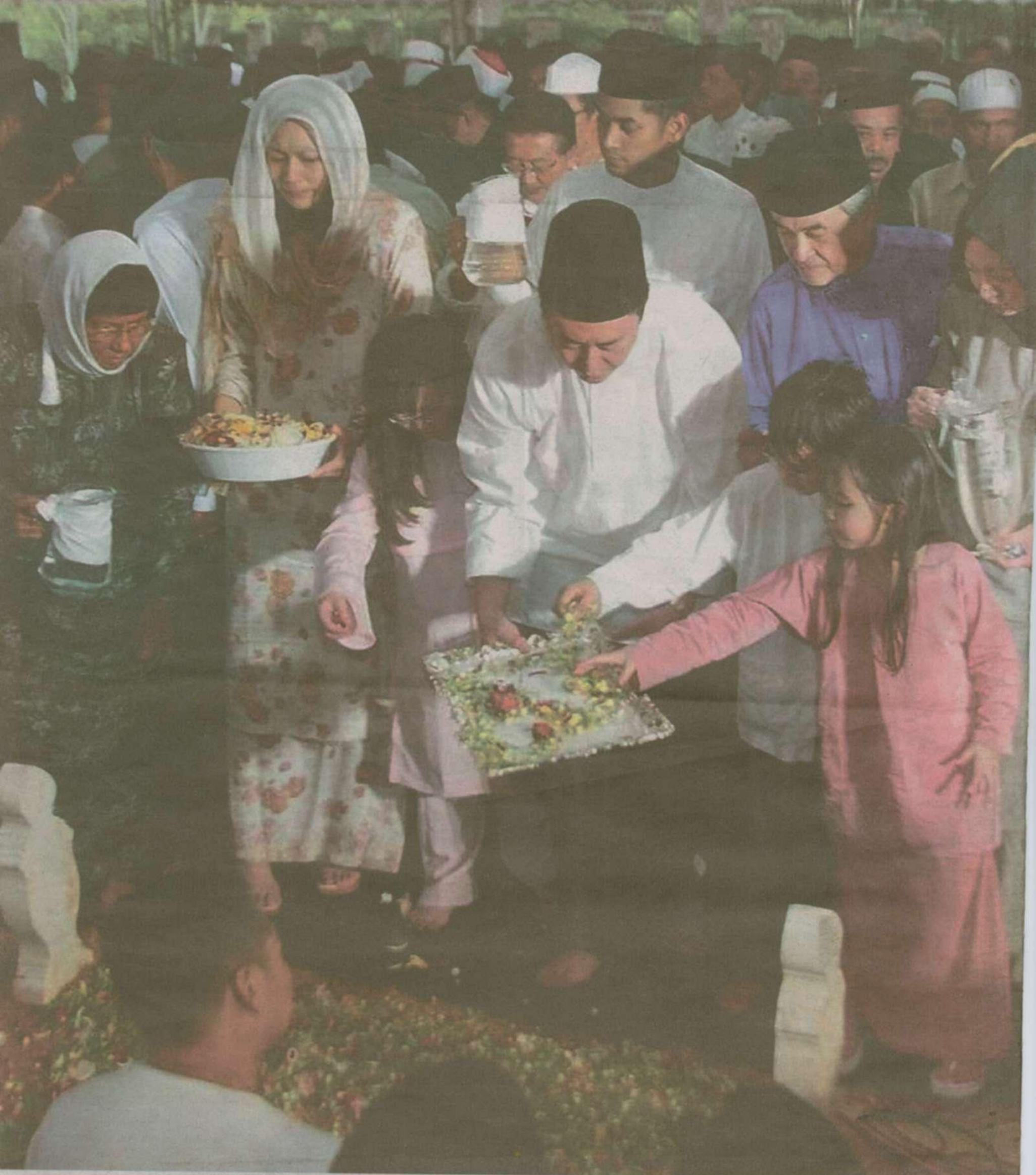
LAST RITES: Endon's grandchildren sprinkling flowers on her grave with help from Abdullah and his children.