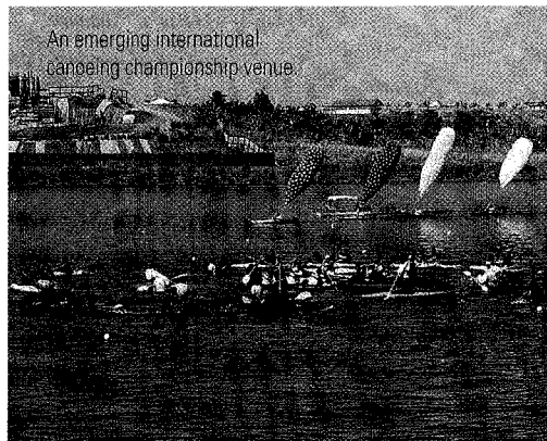
An emerging international canoeing championship venue.