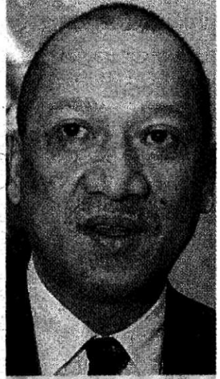
Nazri: 'He called me Brutus, now who is Brutus?'