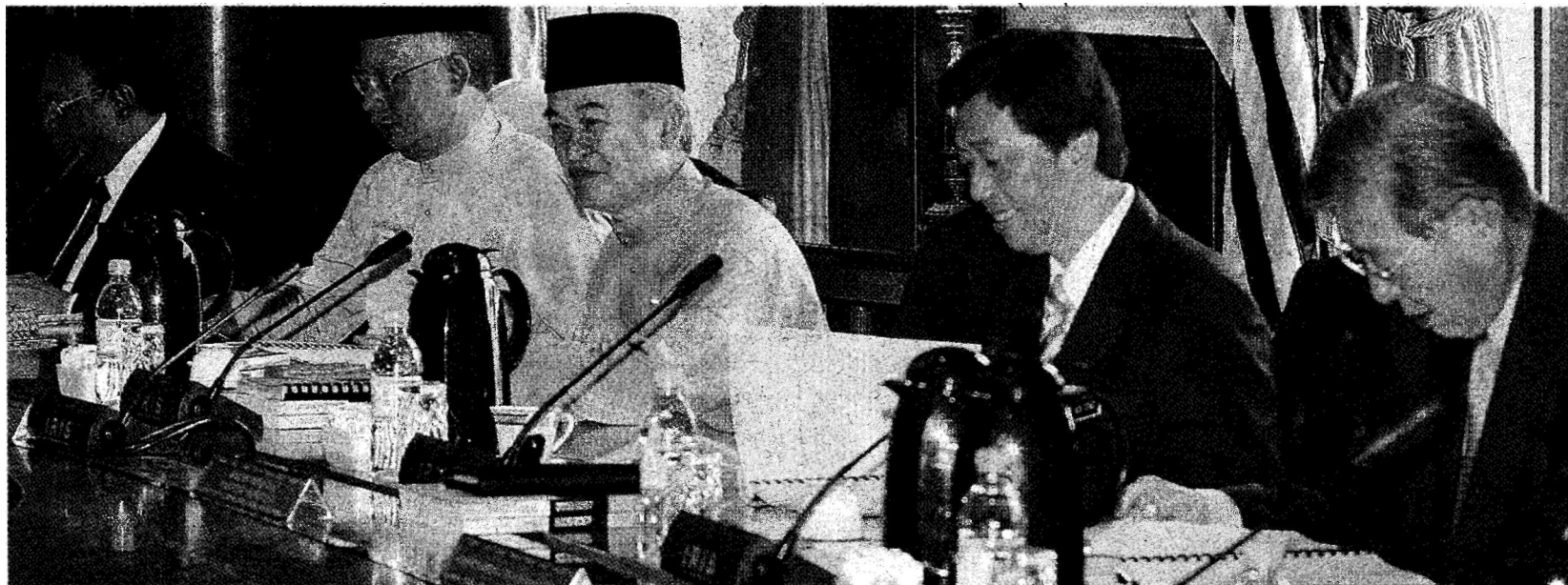
Abdullah (centre) chairing a Cabinet meeting on Budget 2007 at the Prime Minister's Office yesterday. From left are Datuk Seri S. Samy Vellu, Datuk Seri Najib Razak, Abdullah, Datuk Seri Ong Ka Ting and Datuk Seri Dr Lim Keng Yaik.