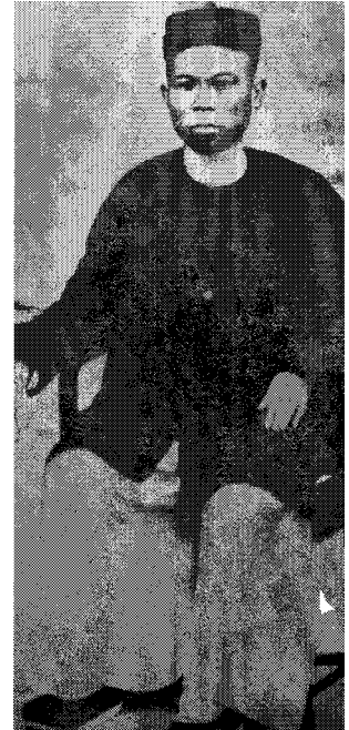
Yap Ah Loy has been excluded from textbooks

"Research showed that students were not interested in history, they had difficulty understanding facts and were only memorising information without appreciating the subject; We decided to consolidate the facts to make the subject less boring," she said.