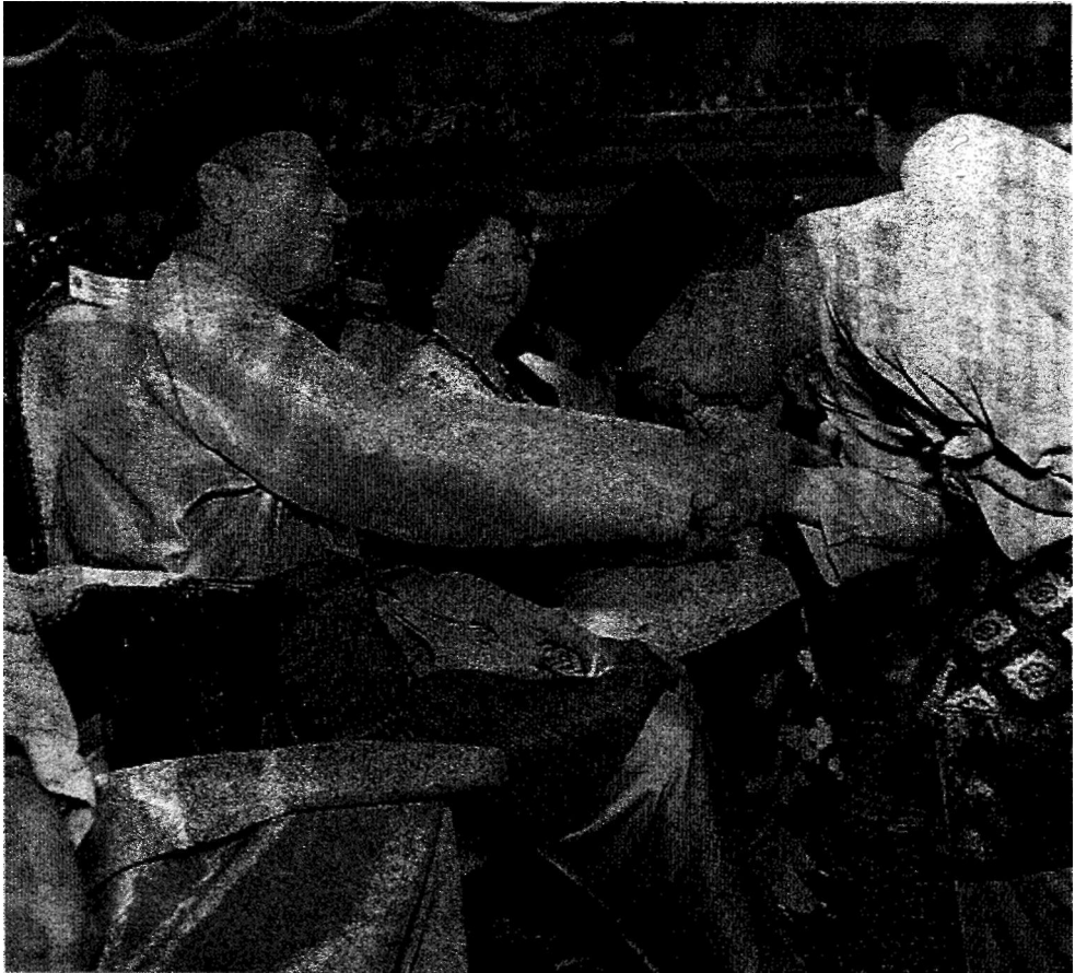
ADORED FIGURE: Mukhriz kissing his father's hand when the former Umno president took his seat at the assembly hall at the PWTC yesterday. Dr Mahathir and his wife Tun Dr Siti Hasmah were special guests at the assembly.

AT LAST year's Umno general assembly - Tun Dr Mahathir Mohamad's final appearance as party president - he was mobbed by members everywhere he went during the three-day meeting.