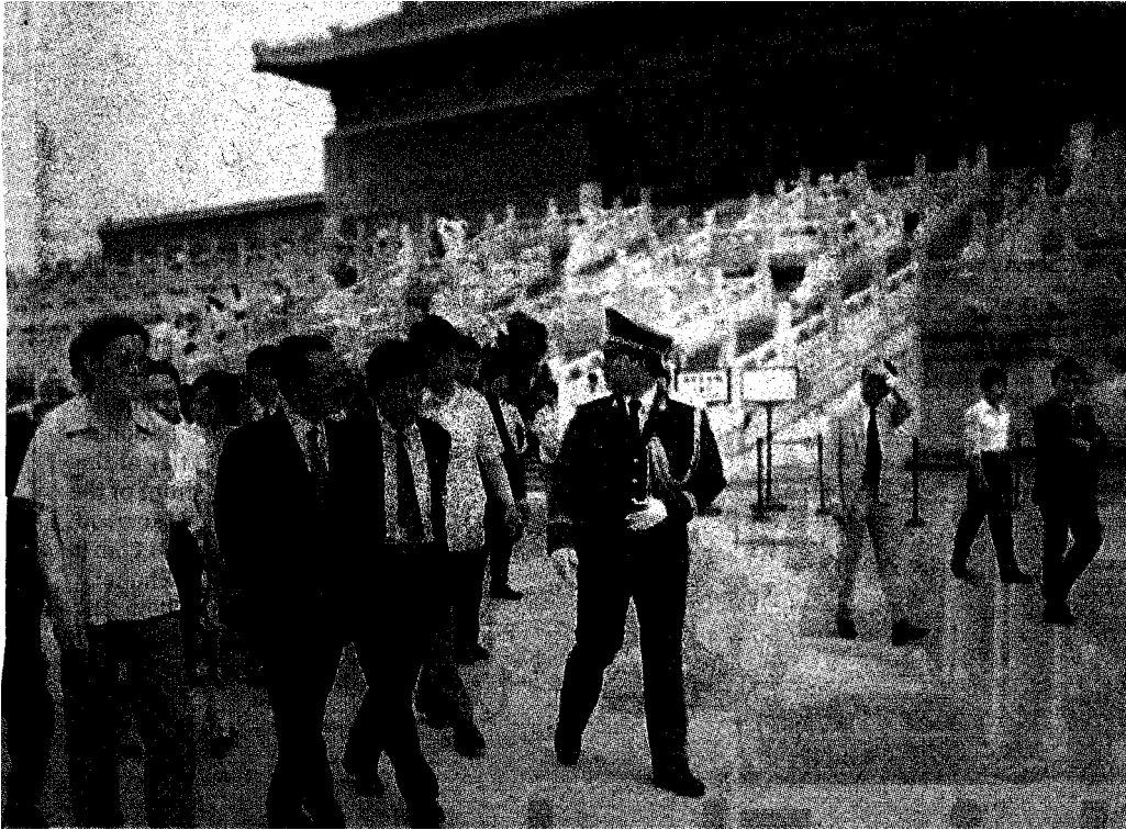
Dr Mahathir being taken around the Forbidden City during a visit to China in 1996