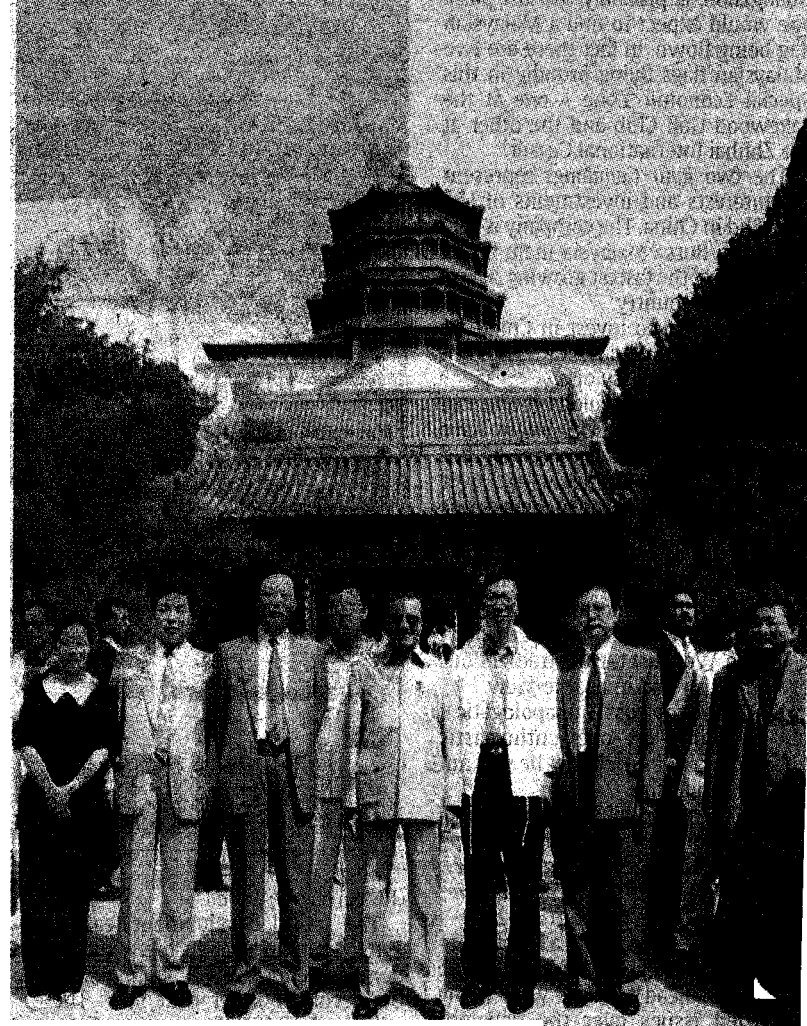
Dr Mahathir and members of his delegation posing for pictures at the Imperial Garden in Beijing during a visit in 1996. On his left is Penang Chief Minister Tan Sri Dr Koh Tsu Koon.