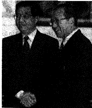
Dr Mahathir greeting the then Chinese vice-president Hu Jintao at his office in Putrajaya in 2002