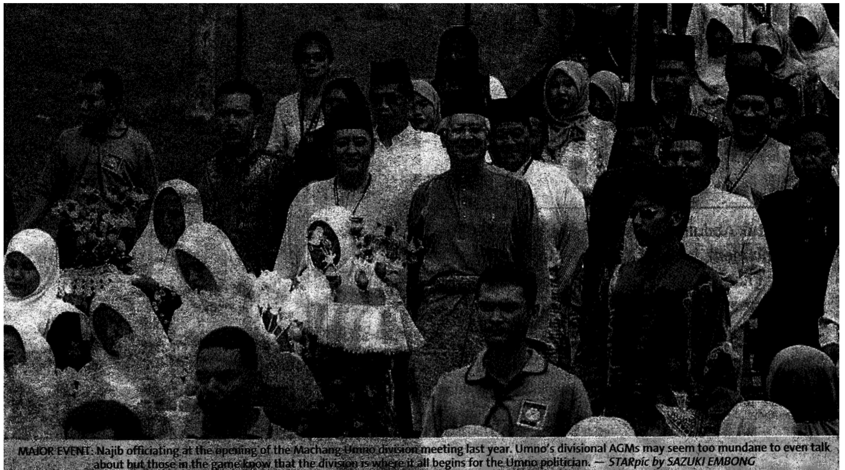
MAJOR EVENT: Najib officiating at the opening of the Machang Umno division meeting last year. Umno's divisional AGMs may seem too mundane to even talk about but those in the game know that the division is where it all begins for the Umno politician.