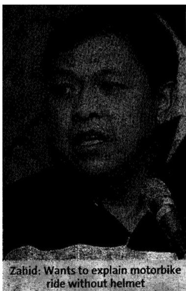
Jilpe: Wants to explain motorbike ride without helmet