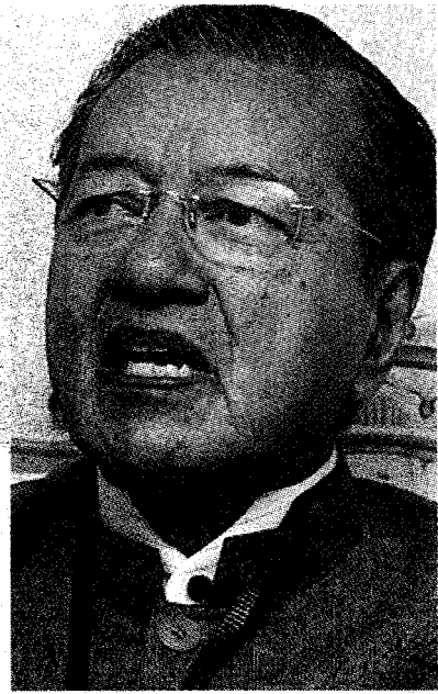
Dr Mahathir: Did a great job getting Malaysia out of the financial crisis

tion with an impressive record at home and abroad. It is a great national asset.