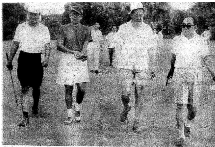
Playing golf with Tun Abdul Razak, Lee Kuan Yew and (former Singapore deputy Prime Minister) Goh Keng Swee at the Bukit Timah Golf Course in Singapore in 1962.

"The question of whether we actually wanted to be doctors or engineers never arose, because as government scholars, we were obliged