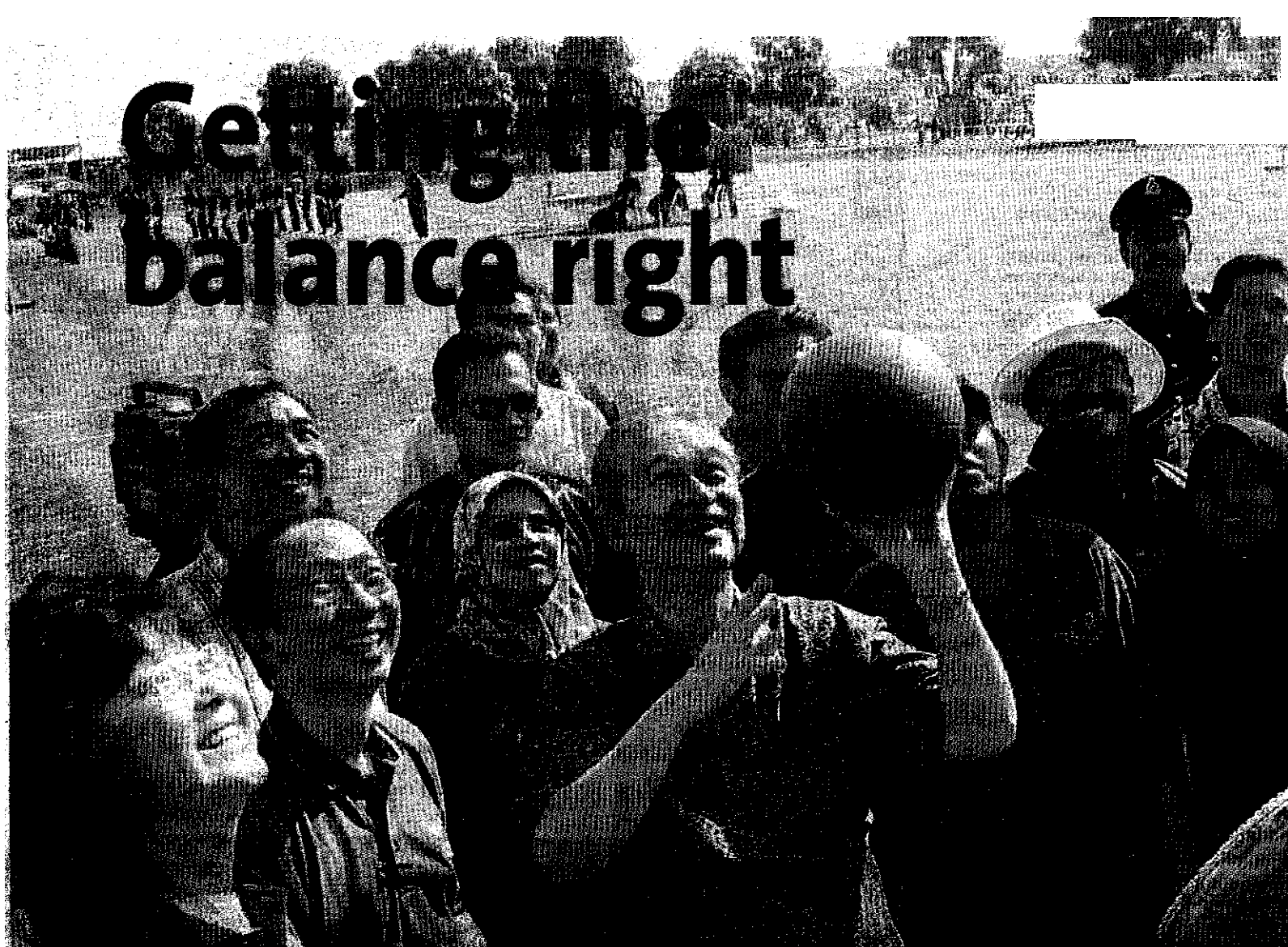
ROTATING GAME: The Prime Minister put a stop to the Penang Umno Youth calls for the Chief Minister's post to be rotated among Barisan partners.

As such the blame game tends to take on rather simplistic tones