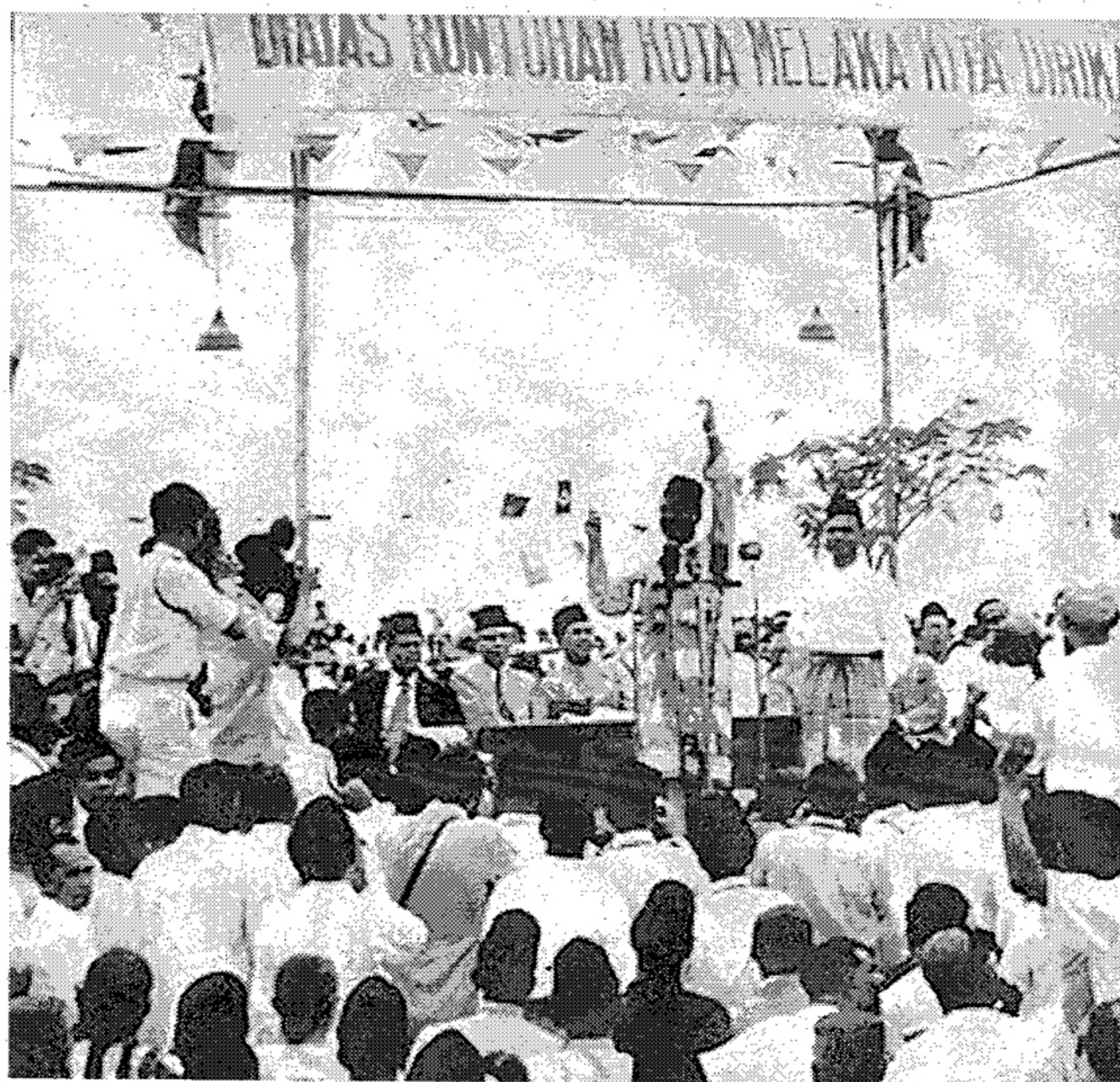
HISTORIC MOMENT: Tunku declaring the date of Independence at Padang Pahlawan on Feb 20, 1956.