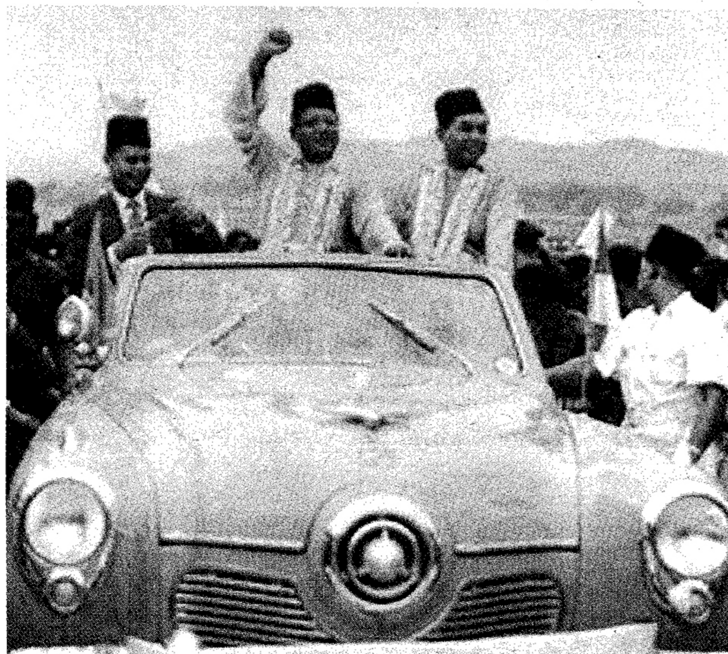
OUR HERO: Tunku arriving at Padang Pahlawan with the joyous news.