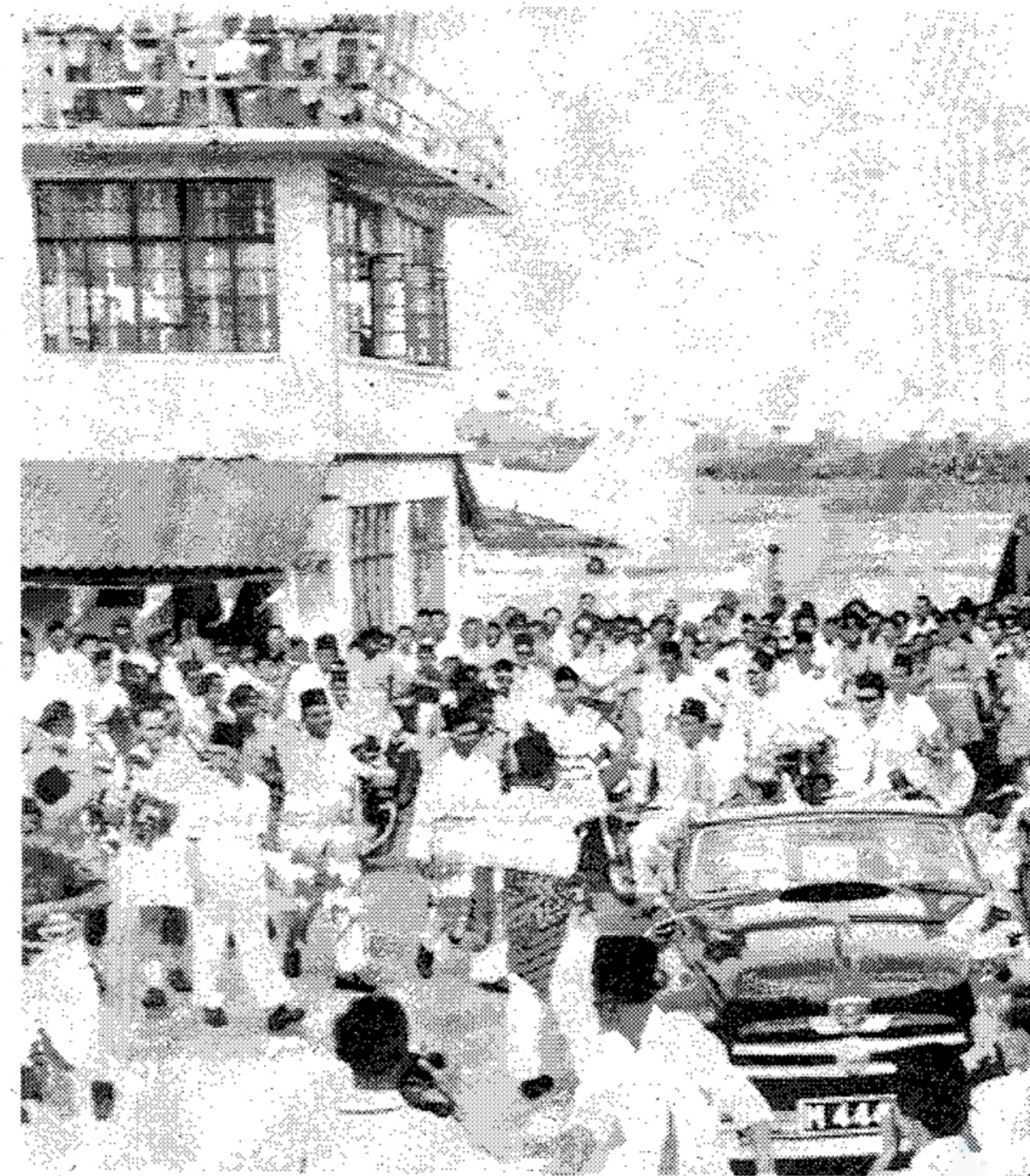
MOBBED: A big crowd had turned up at the Batu Berendam airport to catch a glimpse of Tunku.