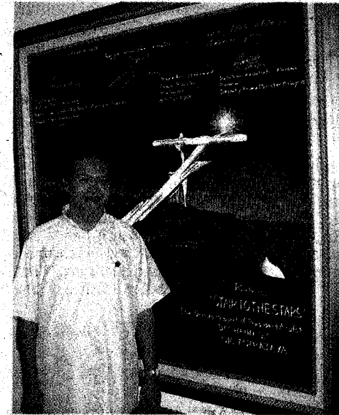
Borhann with the painting 'Stair to the Stars', symbolising the late Yasser Arafat's peace monument overlooking Bethlehem. The monument remains a dream.