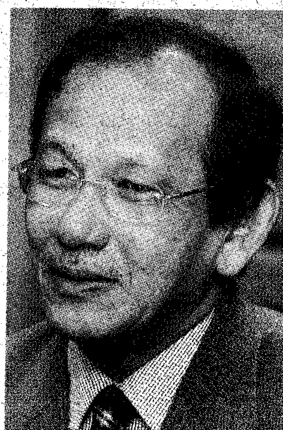
Datuk Seri Mohd Radzi Sheikh Ahmad hopes for more growth

Opposition leader Lim Kit Siang said the focus now should be on the next 50 years. Weaknesses in the way things have been done should be reviewed and improvements in-