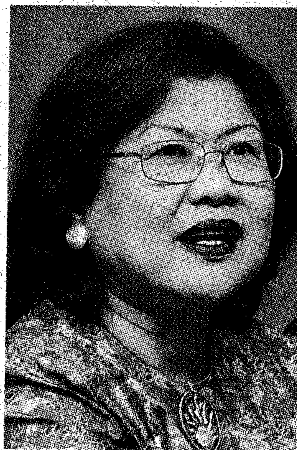
Datuk Seri Rafidah Aziz says it is important for youths to value the Malaysian culture

"But we must now concentrate on the next 50 years. We