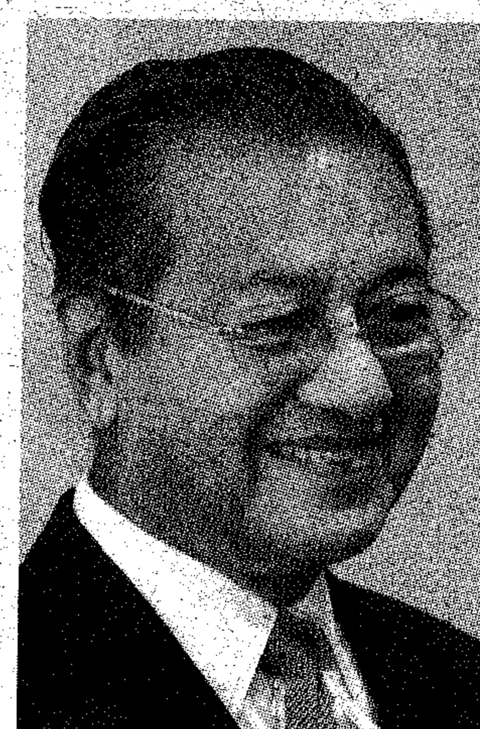
Tun Dr Mahathir Mohamad says this year's celebrations have been the sweetest

special to me, especially the segment depicting the struggles and contributions of five prime ministers throughout the 50 years."