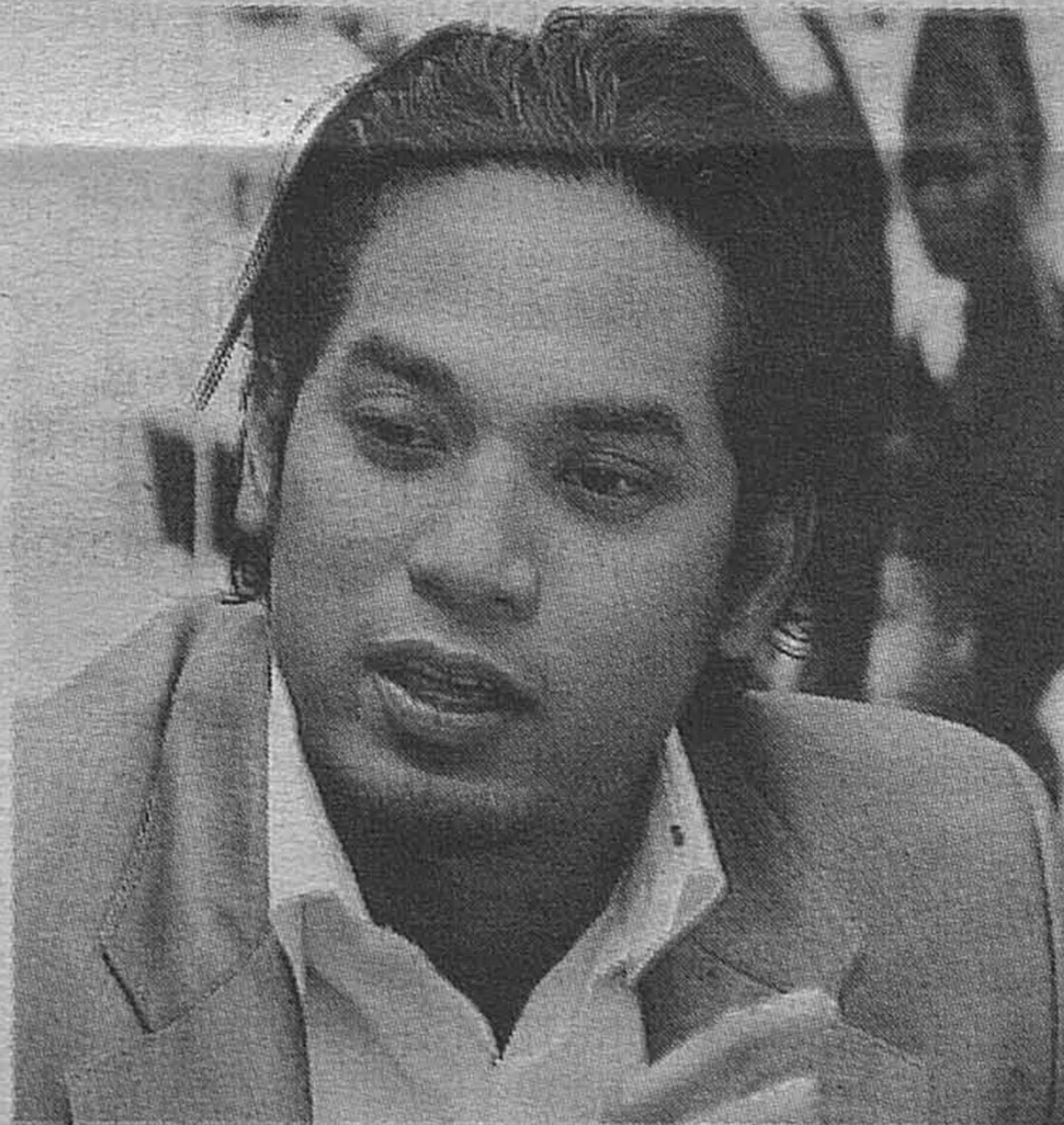
Khairy: 'The important thing is that Umno accepts Najib's explanations'