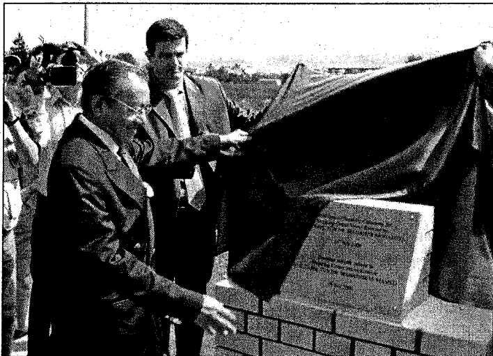
Dr. Mahatir ozvaničava ceremoniju postavljanja kamena temeljca

„Uradili smo analizu tržišta, te fizibiliti studiju kako od strane naših stručnjaka, tako i od međunarodnih neovisnih eksperata, što nas je u konačnici opredijelilo da započemo