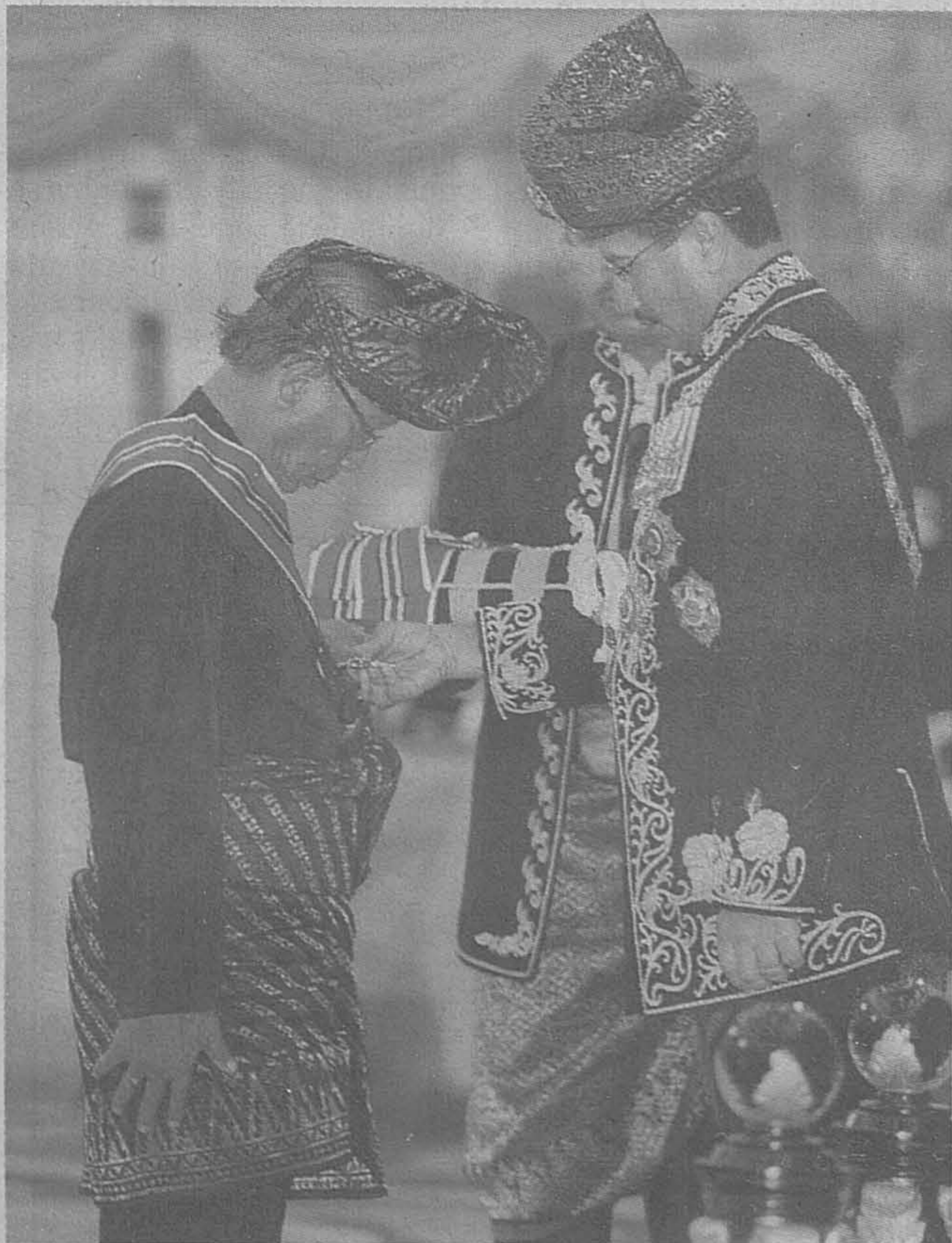
Actor Abdul Azeez Satta @ Aziz Sattar receiving the Panglima Jasa Negara (PJN), which carries the title Datuk, from Tuanku Mizan Zainal Abidin.

A total of 2,309 people were conferred awards, decorations and medals by the king.