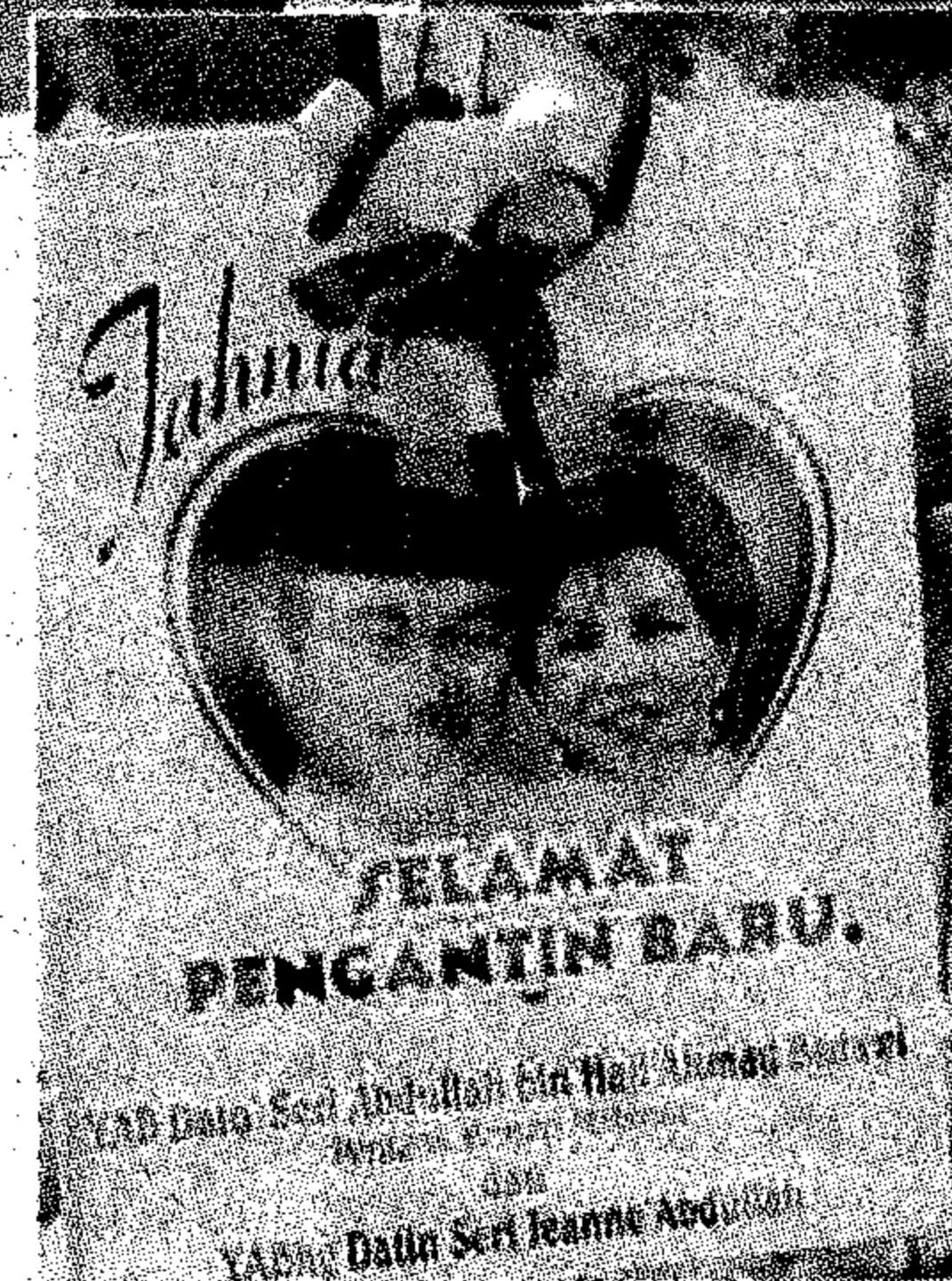
Memento: All the well-wishers received traditional cakes and bunga telur in bags with the picture of the newlyweds.

He also attended Friday prayers at the mosque where the newlyweds were treated to a kenduri .