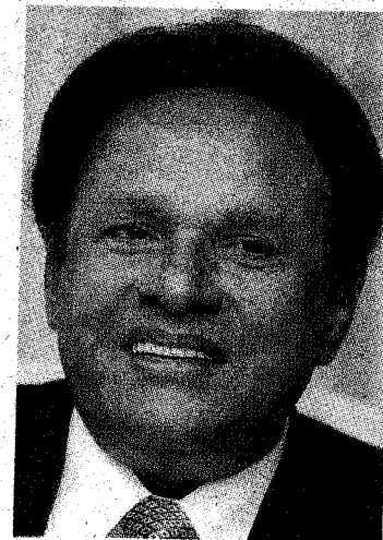
Datuk Seri S. Samy Vellu urges enhancement of race relations

Samy Vellu urged Malaysians to enhance race relations and mutual co-operation to ensure that the nation continued to progress and prosper.