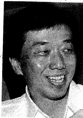
Datuk Seri Ong Ka Ting says preserving traditions is crucial

"As the prime minister, I will focus my efforts towards creating a multi-racial community which is dynamic, progressive, living in peace and harmony, confident and competitive and upholding cultural traditions together."