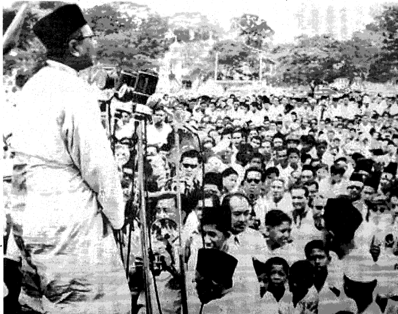
Marking a victory: Tunku giving a speech before a crowd to welcome home the Merdeka delegation from London at Padang Merdeka in Malacca on Feb 20, 1956.

The military police took him by ambulance to the Alor Star hospital. They noticed the sword lying beside him and decided to keep it