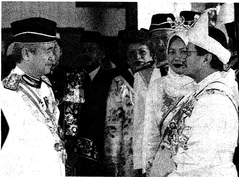
Royal presence: Abdullah greeting Tuanku Mizan and Seri Paduka Baginda Raja Permaisuri Agong Tuanku Nur Zahirah on their arrival at Parliament House on Monday.