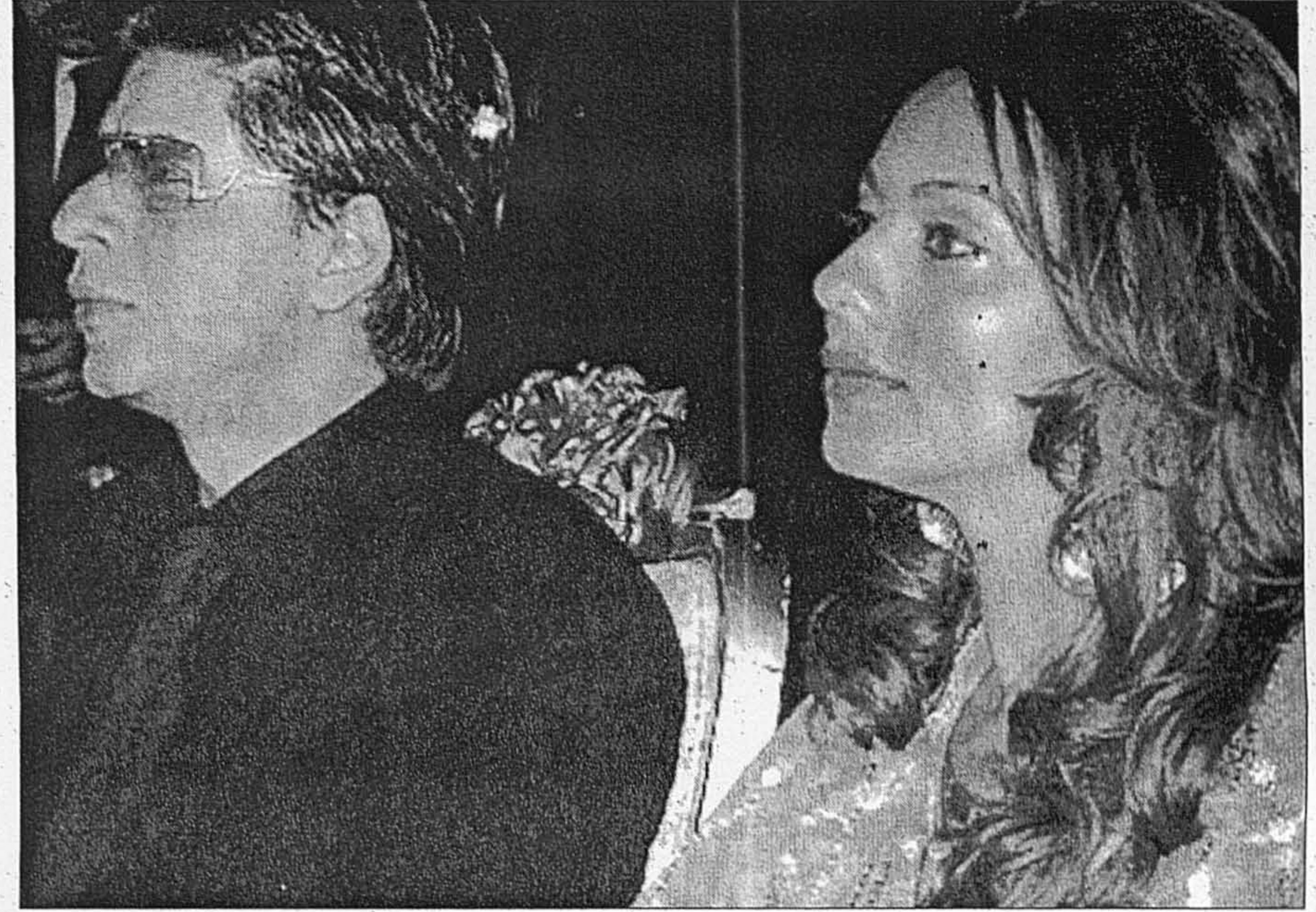
Shah Rukh Khan bersama isteri Gauri Khan yang telah berkahwin pada tahun 1991.

< Keratan temubual majalah 'The Edge' dengan Shah Rukh Khan yang disiarkan baru-baru