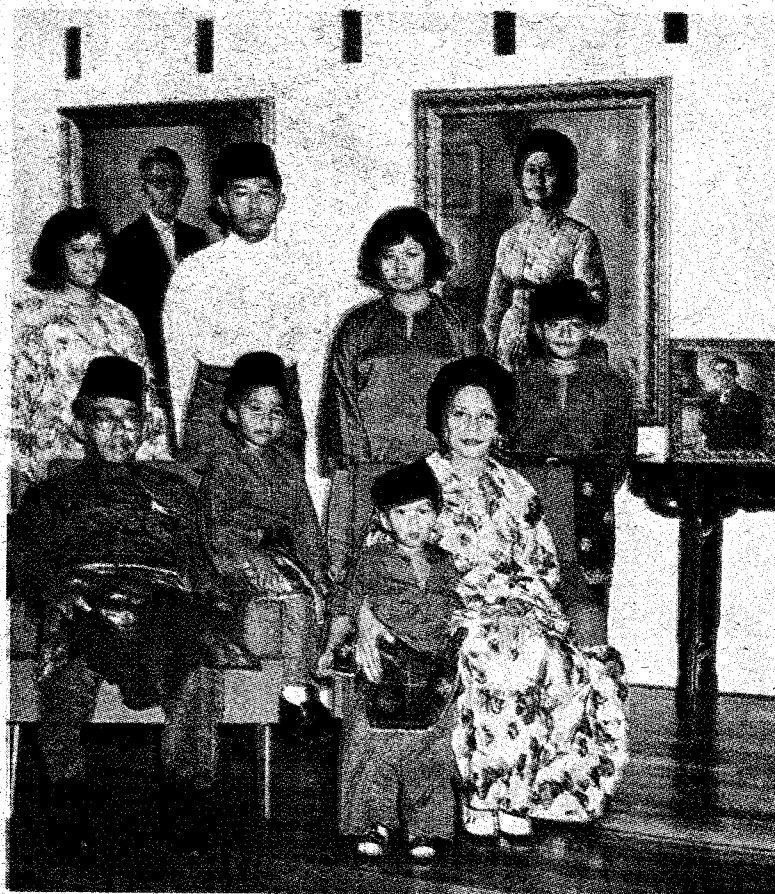
Dr Ismail with his wife Norashikin Mohd Seth, whom he married in 1950, and their children.

The feat of achieving unity for the gaining of independence from the British had now to be paralleled by