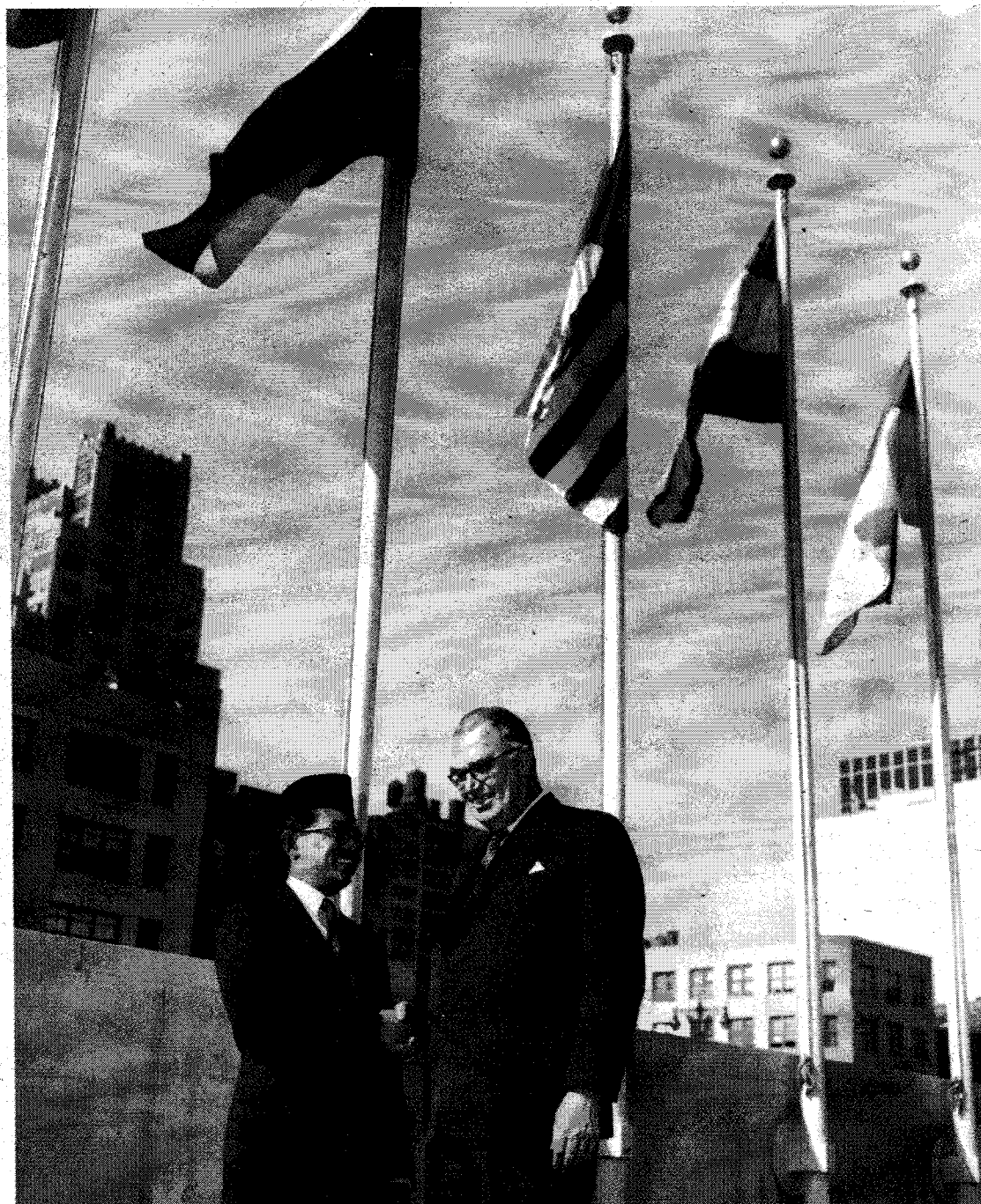
Sir Leslie Munroe of New Zealand (right), president of the United Nations General Assembly, congratulating Ismail after the flag of the newly independent Malayan Federation was raised in a ceremony at the UN headquarters in New York on Oct 15, 1957.

Laos and Vietnam. We have no choice. We, the nations and peoples of Southeast Asia, whatever our ethnic, cultural or religious backgrounds might be, must pull together and create, with hand and brain, a new perspective and a new framework. And we must do it ourselves. We must create a deep, collective awareness that we cannot survive for long as independent peoples — as Burmese, Thais, Indonesians, Laotians, Vietnamese, Malaysians, Cambodians, Singaporeans and Filipinos — unless we also think and act as Southeast Asians.