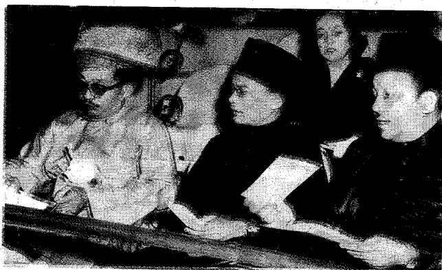
The Malayan delegation at the opening session of the 12th General Assembly in New York on Sept 17, 1957. Ismail is at left.

■ TOMORROW: The formation of Malaysia was followed by two major challenges — Confrontation with Indonesia and the separation of Singapore. Their toll on Dr Ismail's worsening health leads to his resignation from the Cabinet.