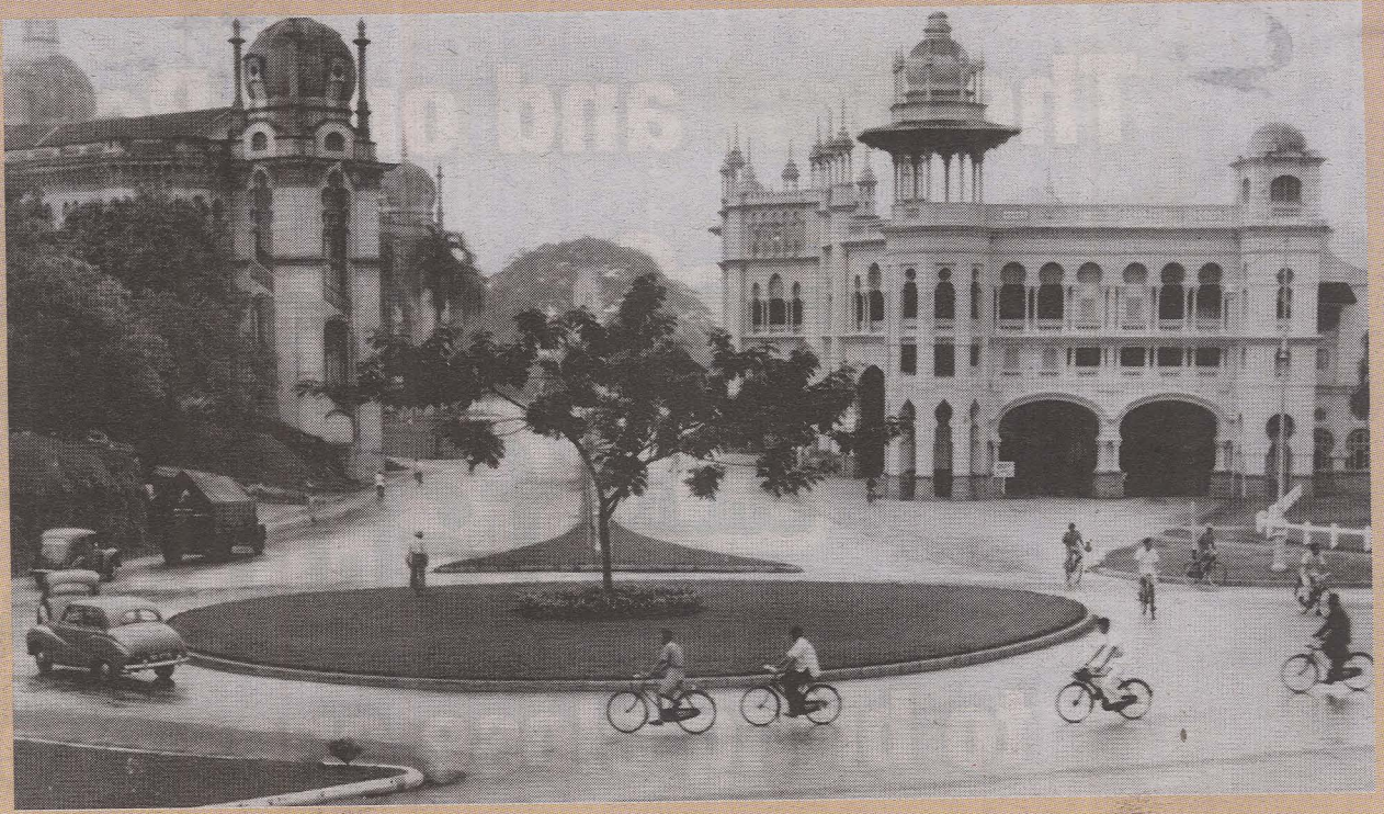
The Kuala Lumpur railway station back in the 1950s.