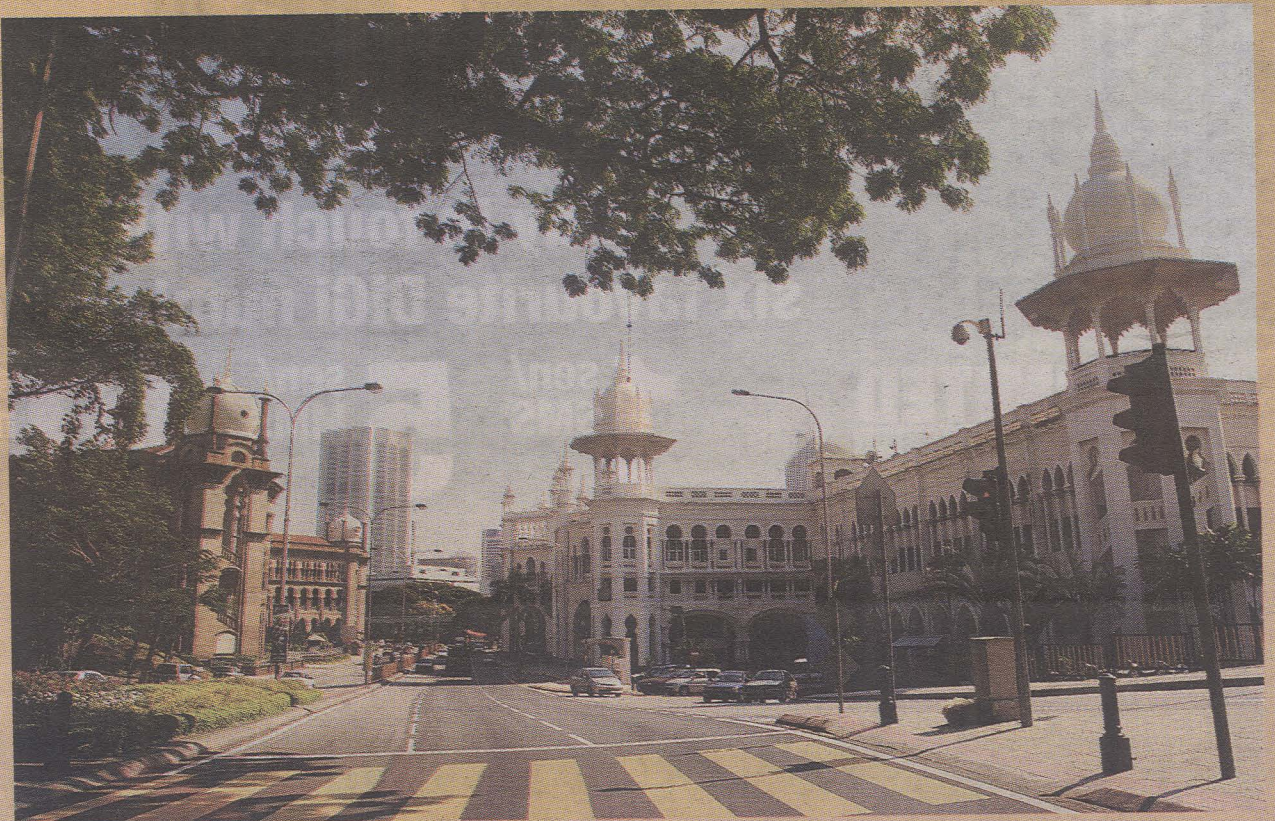
The prominent Moorish-style buildings still standing 50 years on.