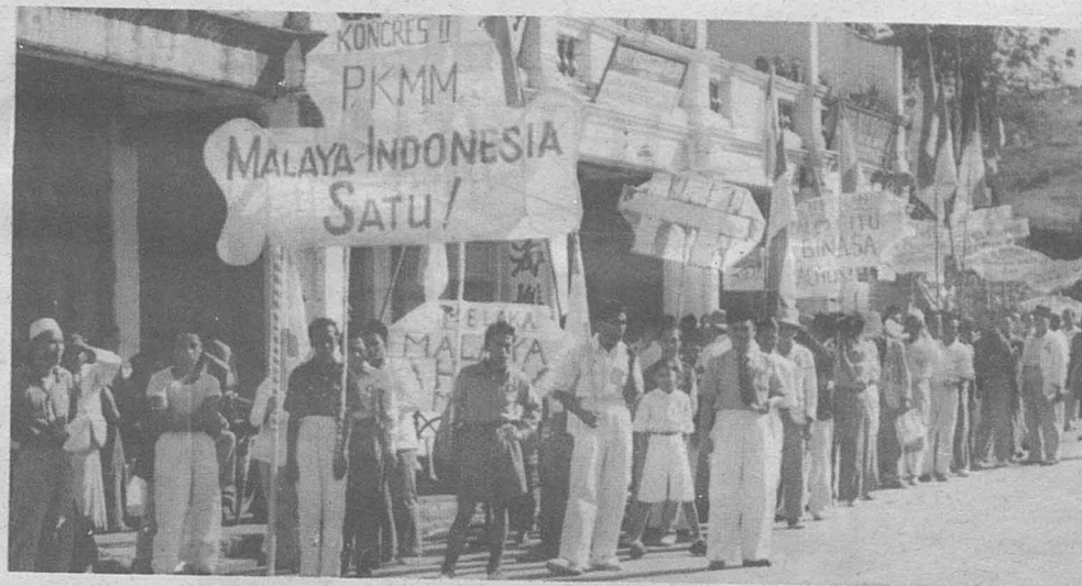
Parti Kebangsaan Melayu Malaya and Parti Semenanjung Melayu Johor members were united in protesting against the Malayan Union although their nationalistic ideologies were different.

HE looked perplexed as he scratched his head, examining the dozens of medicine bottles and herbal supplements spread out on the coffee table.