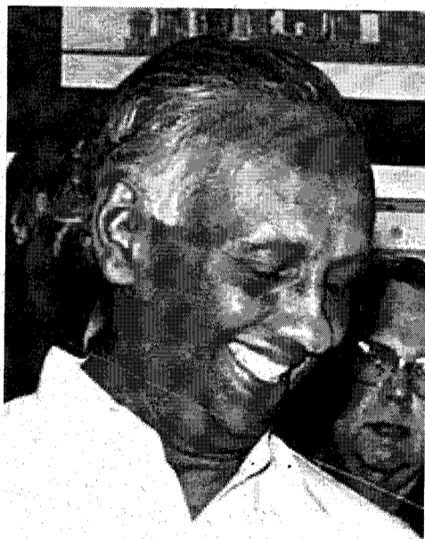
Sambanthan: Is remembered for his quest for national unity.