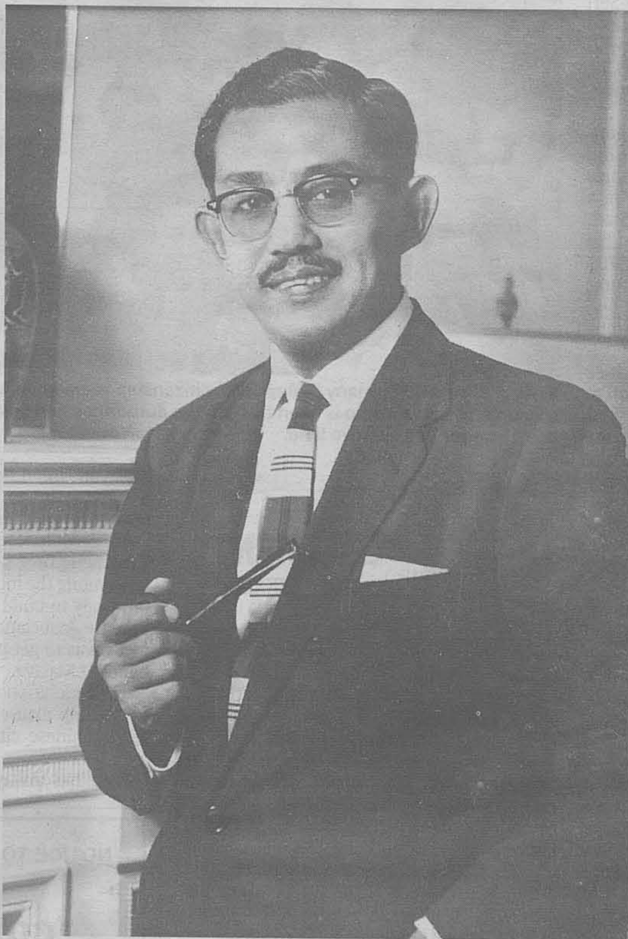
Ismail: A doctor by training turned reluctant politician.

Road Transport and Natural Resources were soon added to Ismail's responsibilities.