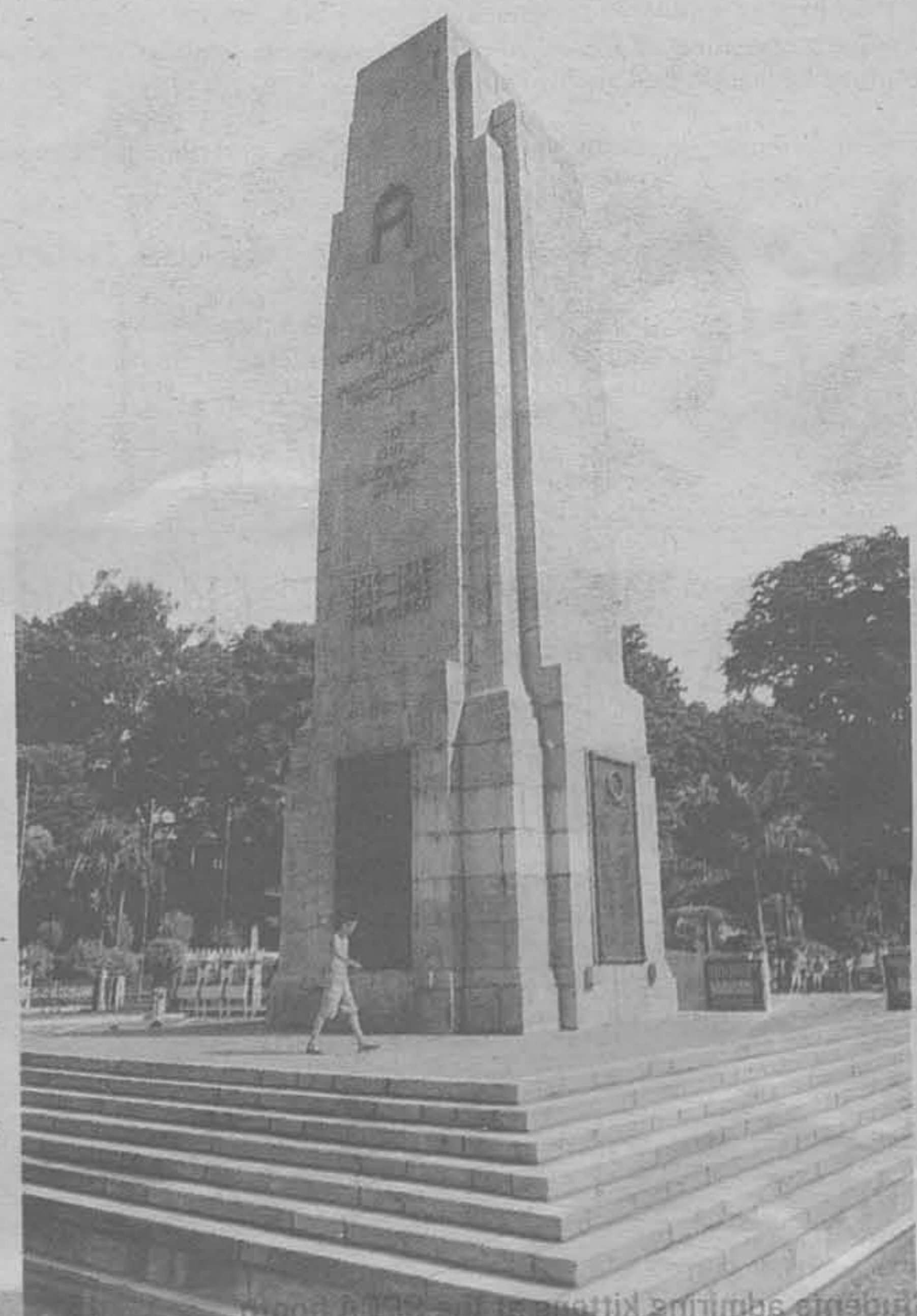
No more: The original monument set up by the British administration to commemorate the wars and honour the fallen heroes.