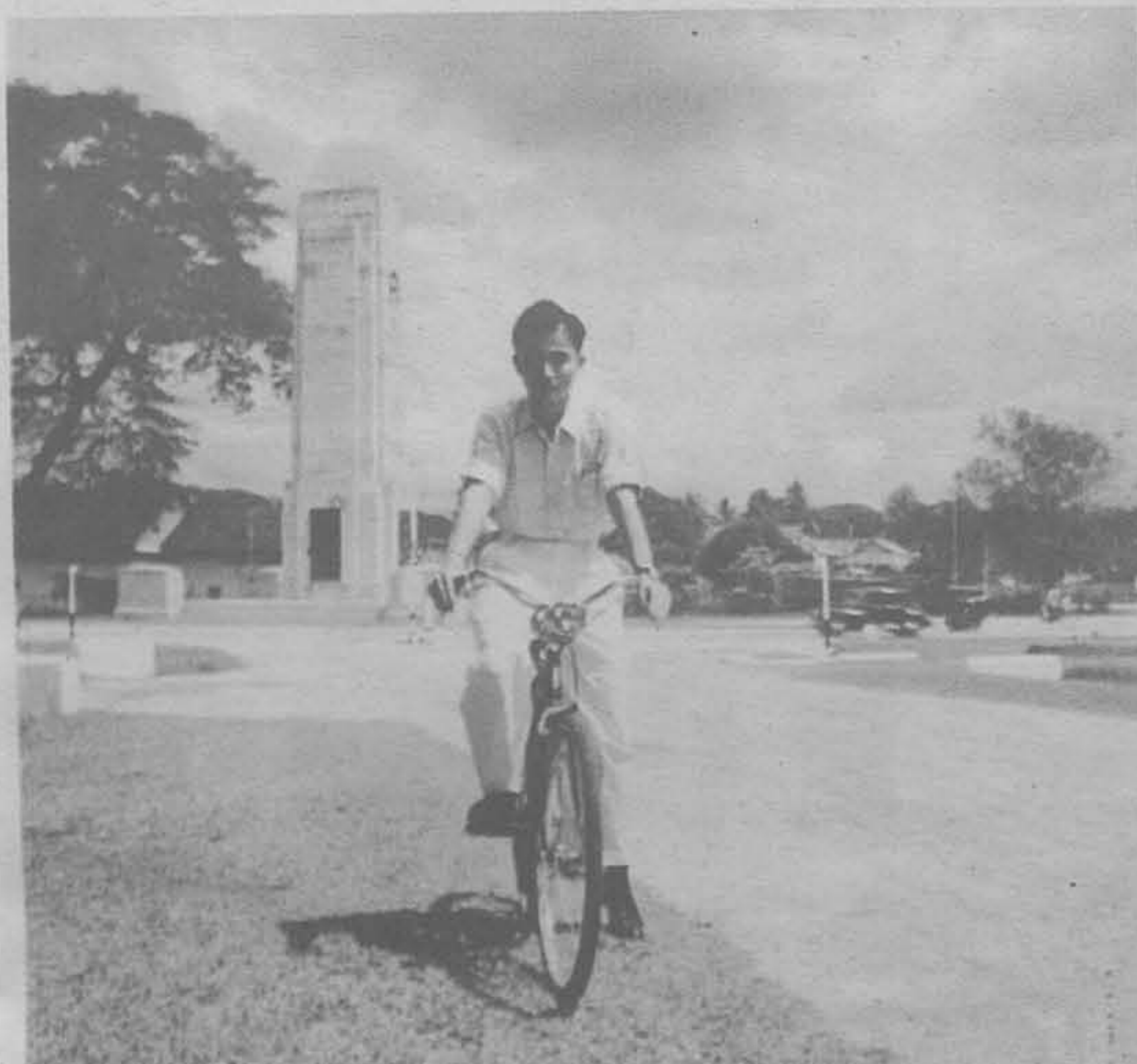
Serene: A picture of Jalan Tugu taken in 1957.

Every year on July 31, Warriors Day, the King, the Prime Minister and heads of military and the police would pay their respects to the fallen heroes by laying garlands at the monument.